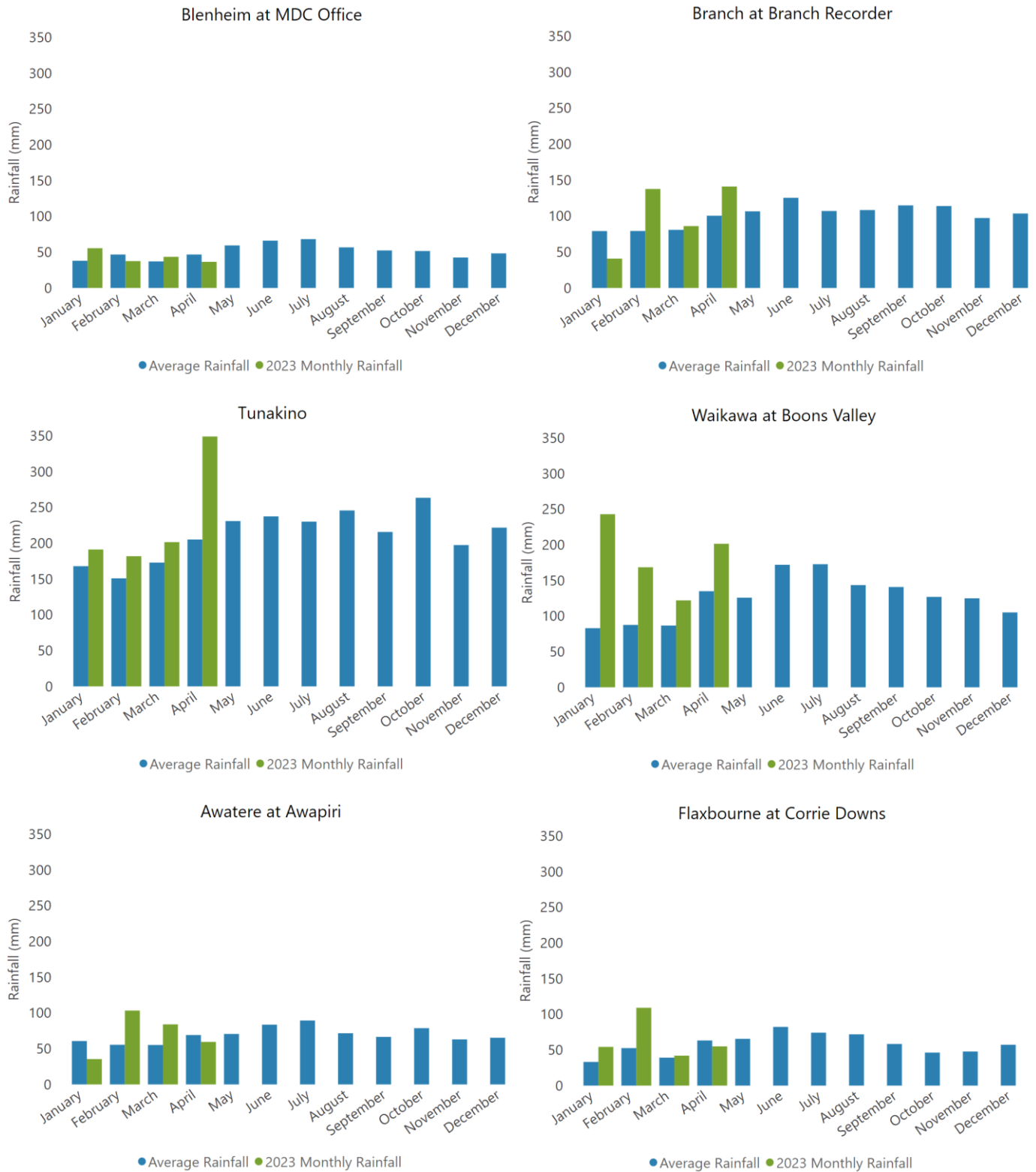
Figure 1. Monthly rainfall totals for 2023 from 6 key sites around Marlborough, compared to average monthly rainfall totals.