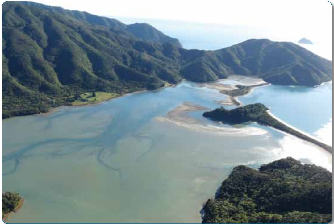
Whangarae Estuary (MDC)

Whangarae Bay is located approximately 5 km south-east of Cape Soucis and forms the south-western arm of Croisilles Harbour. Whangarae Estuary has a coastline of approximately 6.8 km, and covers an area of 113.5 ha. The estuary is approximately 2.3 km long, and up to 1 km wide.