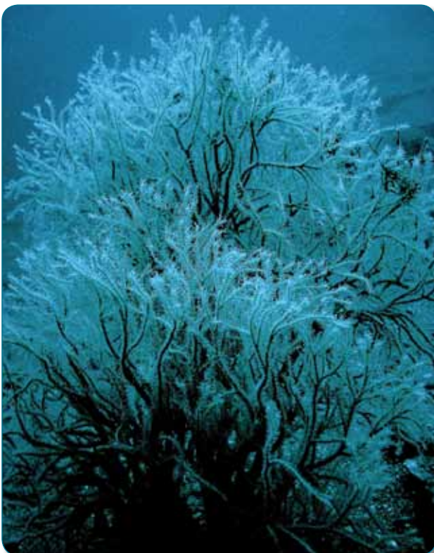
Hydroid trees (Rob Davidson)

Common reef fish include short-tailed stingray, eagle ray, conger eel, rock cod, sea perch, slender roughy, sweep, butterfly perch, goatfish, yellow-eyed mullet, marblefish, red moki, tarakihi, spotty, banded wrasse, scarlet wrasse, blue cod, triplefins (yellow-black triplefin, common triplefin, mottled triplefin, variable triplefin, blue-eyed triplefin, longfinned triplefin, spectacled triplefin) and leatherjacket. Butterfish are found on reefs that support dense beds of large brown algae. Snapper are present year round but are most abundant inshore during summer.