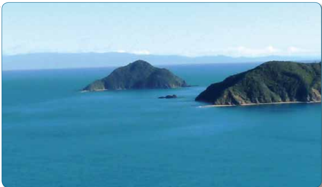
Motuanauru Island (MDC)

Motuanauru Island is the western-most and second largest of the three Croisilles Islands on the eastern side of the entrance to Croisilles Harbour. It has a coastline of approximately 1.4 km and covers an area of approximately 9.5 ha.