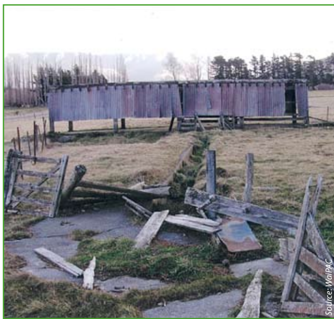
Swim through dip

Occupiers and landowners are required to take all practical steps under the Health and Safety in Employment Act 1992 to 'eliminate, isolate or minimise' any hazards to ensure the safety of their employees and contractors working on or around dips, including during any remediation activities. Landowners and occupiers also have a responsibility to ensure non-work related people, including children and visitors, do not come to harm from the dip site. Accidental drowning has occurred at a plunge dip and personal injury has been known to happen from falls and trips around dips sites. Some dip sites are situated in 'amenity land' - areas of public land or public access (e.g. camping grounds) and owners and occupiers need to ensure visitors and residents are not exposed to unnecessary risk.