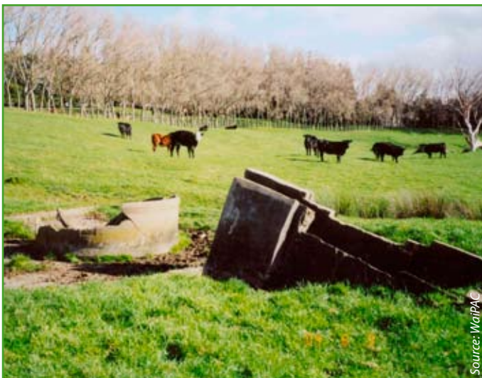
Outline of former plunge dip

Regional Councils are able to apply for Government funding to assist with the remediation of contaminated land, which will provide part of the costs if an application is successful.