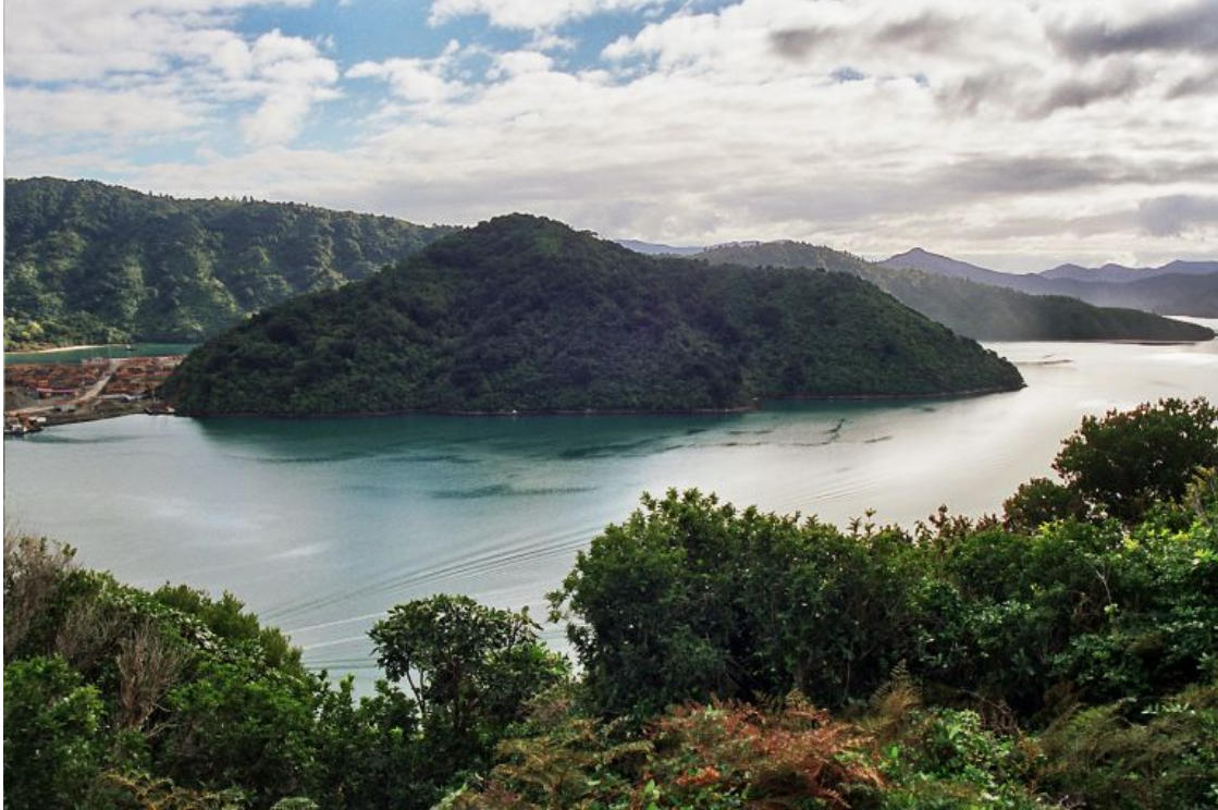
Above and below: Two views of Kaipupu Point. A virtual island, it would make a great “mainland island” for the restoration of special fauna and flora. In tandem with ecological restoration in Victoria Domain and its associated reserves, it could become a prime showpiece on the doorstep of Picton.