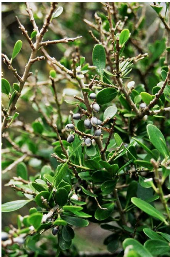
Left: Close-up of Melicytus aff. obovatus , showing the leathery leaves and two-tone fruit. Possums are destructively browsing this species.