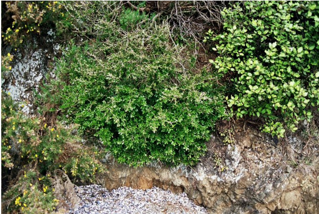
Above: The unusual coastal shrub Melicytus aff. obovatus (centre), growing with gorse and akiraho on the shore south of Bobs Bay. This plant, a relative of mahoe and porcupine shrub, is endemic to the Cook Strait region. Its occurrence here is the most inland known.