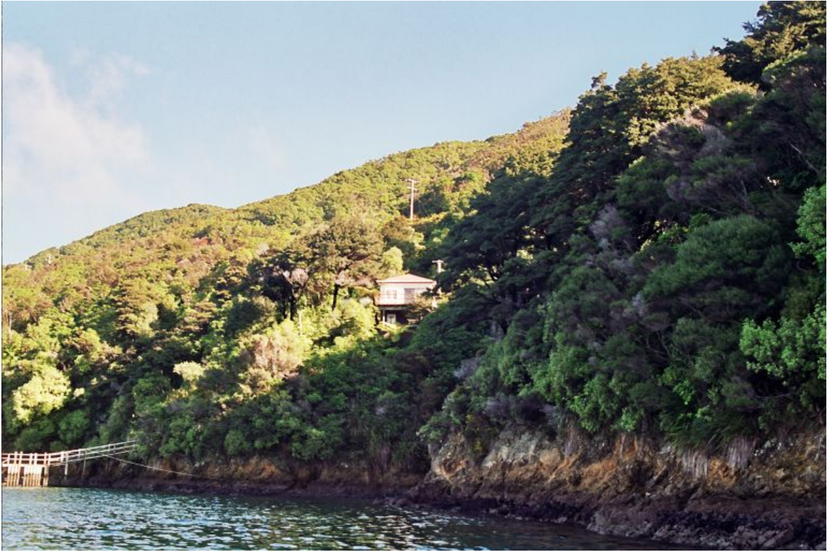
Above: A traditional private bach nestled into the bush at the base of The Snout. There are black beech trees on the low spurs and a big pukatea in a nearby gully.