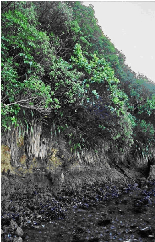
Left: The shore fringe on the Waikawa Bay side of The Snout. Akiraho and wharariki (coastal flax) are dominant. Of note are several large puka ( Griselinia lucida ) trees.