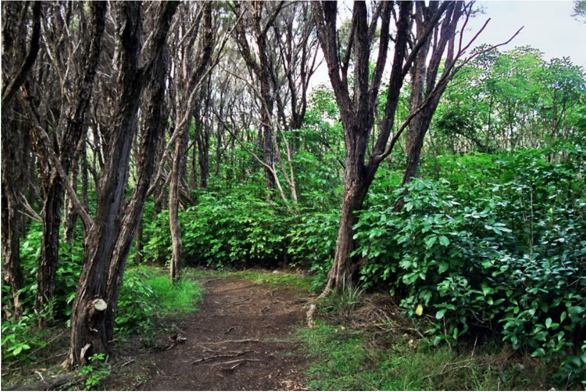
Above: Dense regeneration of native broadleaved vegetation beneath kanuka-manuka forest, The Snout.