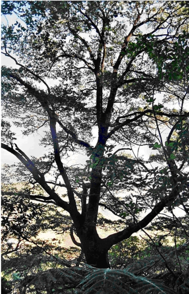
Left: The spreading head of a hard beech, one of the largest and oldest trees in Victoria Domain. This is growing in the central eastern remnant of the photo above.