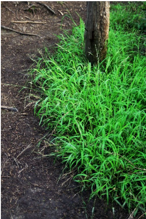
Left: Veld grass ( Ehrharta erecta ), a troublesome weed, growing alongside the track to The Snout. Also visible in the photo above. This South African grass should be controlled using herbicide in such places, to prevent its potentially rampant spread throughout the reserve system.