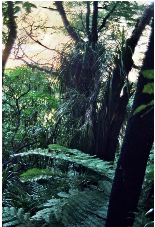
Right: Kiekie, tree ferns and tall mahoe associated with the hard beech, reminders of the original lush forest cover.