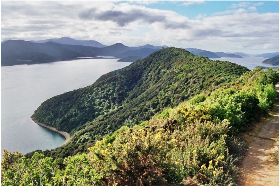
Above and below: Two aspects of The Snout peninsula, looking north-eastwards down Queen Charlotte Sound. Most slopes are covered in rapidly regenerating native forest, having largely replaced an earlier cover of gorse and manuka.