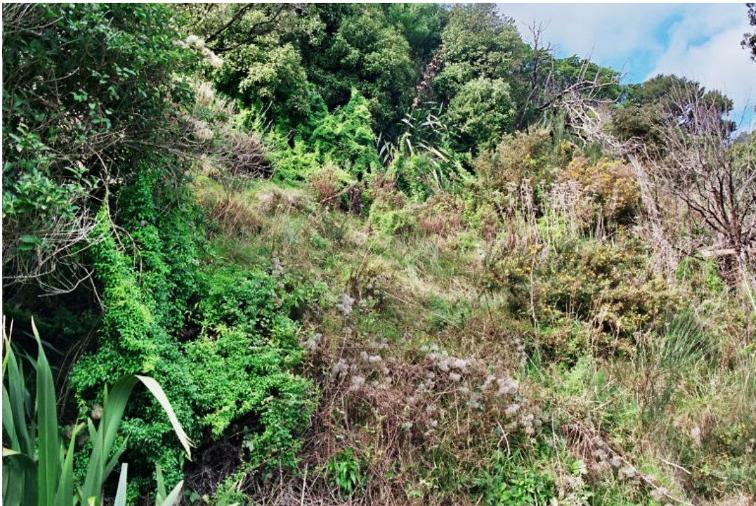
Below: Serious weeds at Shelley Beach, SW Victoria Domain: old man's beard, smilax, robinia and Japanese honeysuckle. These are being controlled, a task that will need to be ongoing.