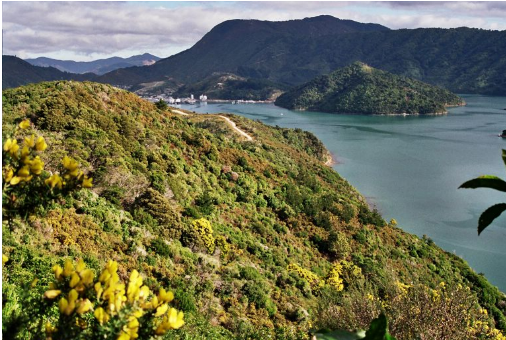
Above: Looking southwards from The Snout walking track into Picton Harbour. Wilding pines can be seen protruding from the regenerating native forest and the yellow canopies of wattles in flower are on the slope in the lower right. These exotic trees are due to be felled shortly, which will remove a major weed threat.