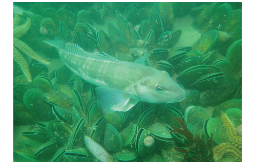
A blue cod swimming over a flourishing green-lipped mussel bed

The project will continue for another three years.