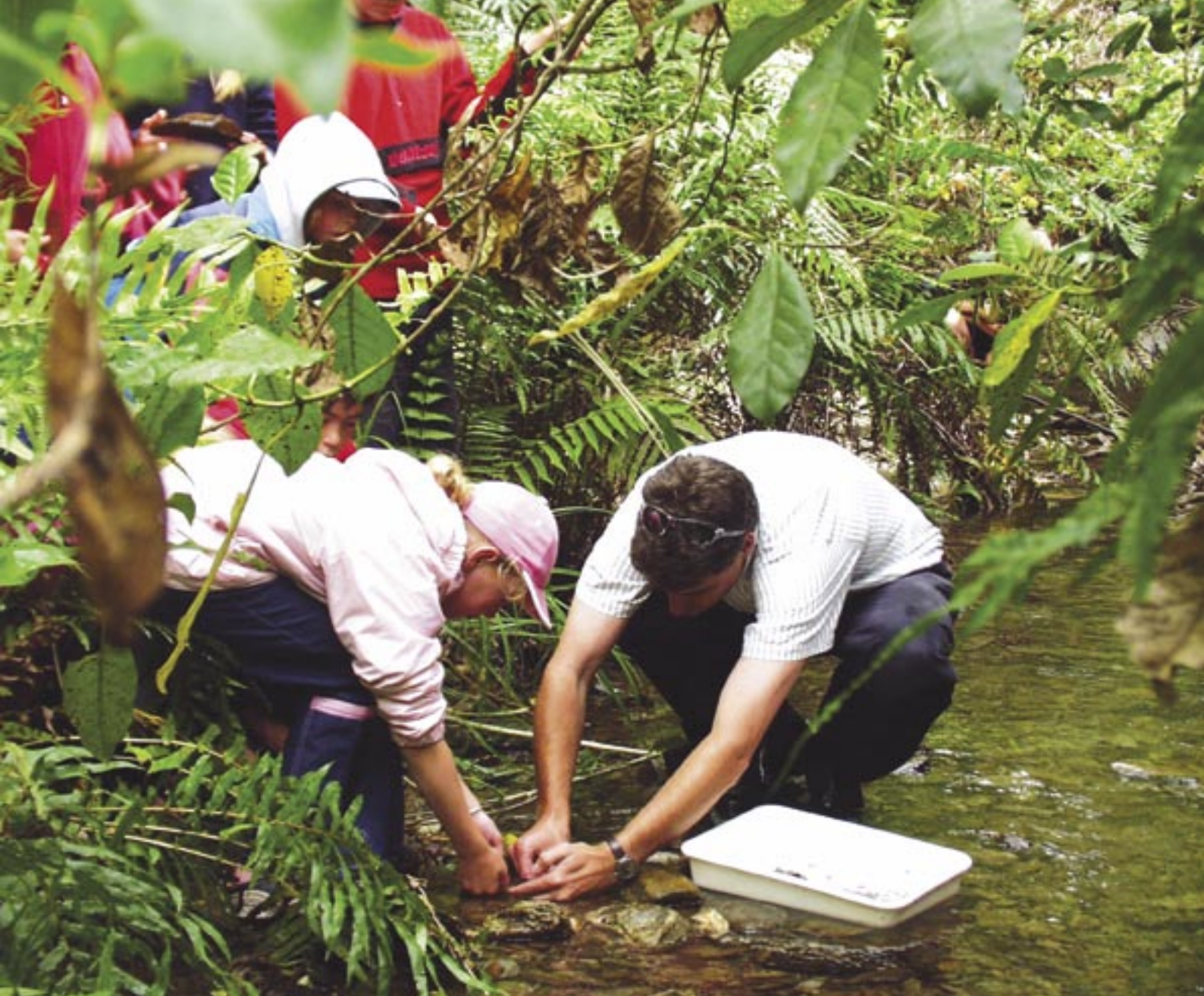
Council Staff working with school children