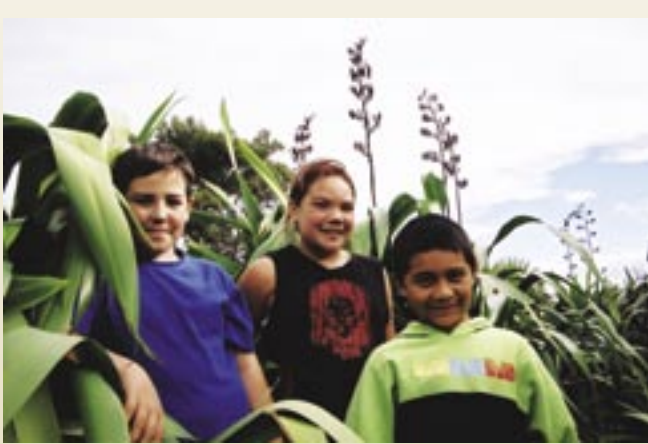
Children in flax at Grovetown Lagoon