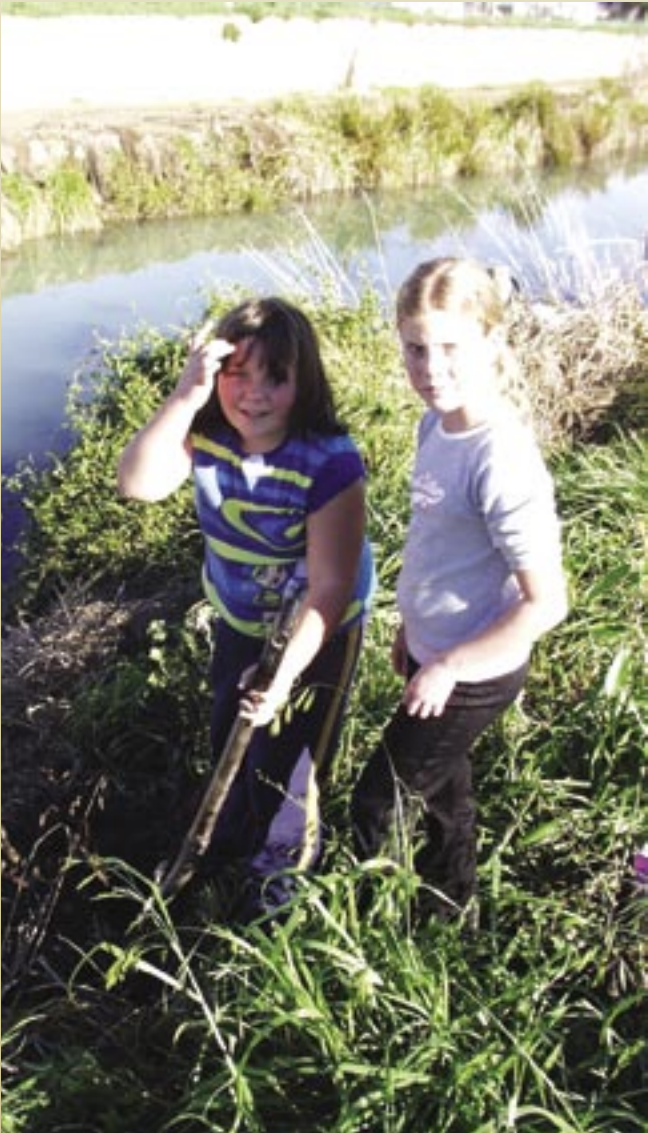
Planting by school children along the margins of the Grovetown Lagoon