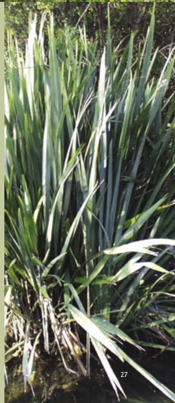
Flax is a common wetland species