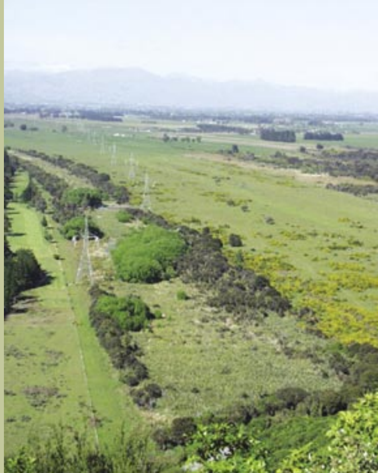
Rarangi Beach ridge wetland

Bogs are wetlands that are only fed by rainfall and are therefore low in fertility and are acidic. Bogs are very rare in Marlborough with less than 1 hectare of bog remaining.