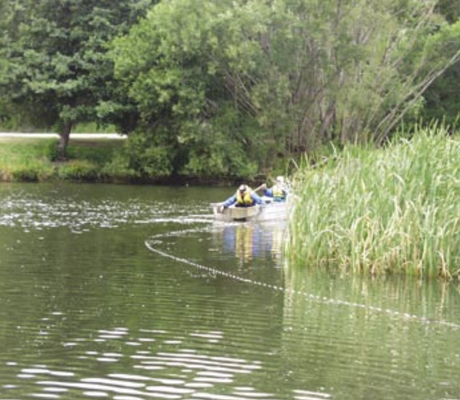
Setting nets in the Taylor Dam