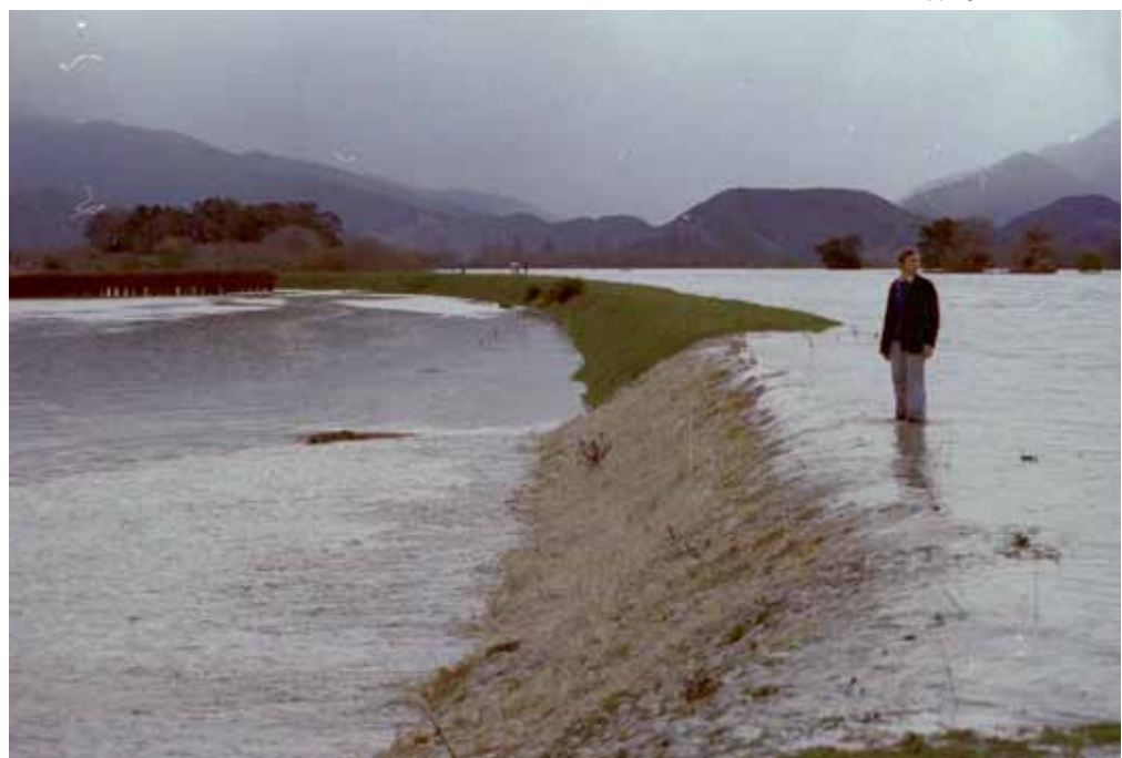
Flood waters overtopping flood bank, 1983

The Building Act requires local authorities to develop a policy for those local buildings most vulnerable in a moderate earthquake. The Council's policy requires the earthquake risk of mostly non-residential buildings to be evaluated and require earthquake prone buildings to be strengthened. An assessment of buildings at risk has been carried out and property owners notified of the need for the buildings to be strengthened.