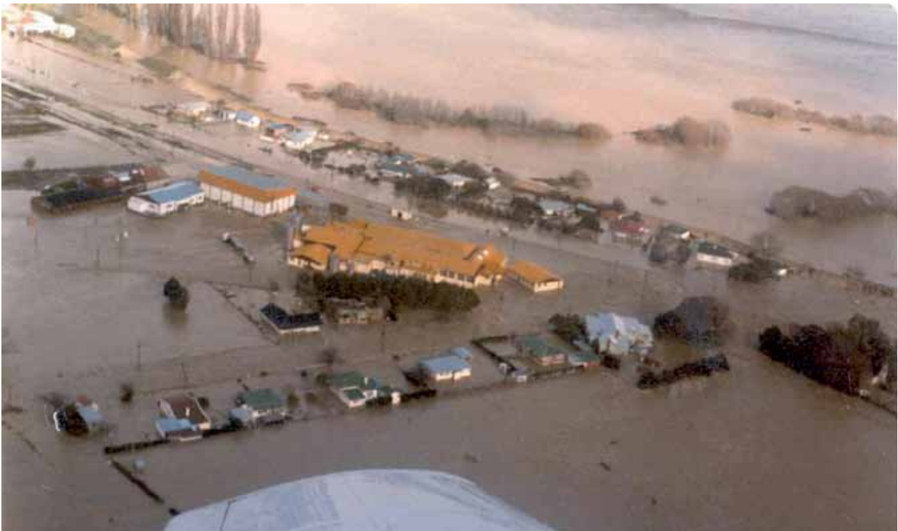
Tuamarina - 1983 flood

The Wairau River carries a significant bed load of gravel. The gravel can accumulate and create significant deposits within the bed of the river. These deposits have had to be actively managed to ensure that they do not also prevent an efficient floodway channel. The main form of management is to allow the periodic removal of gravel from strategic areas. This has been a win-win situation given the demand for aggregate.