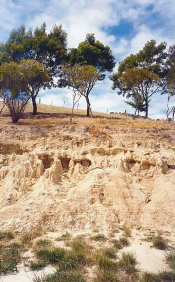
Dense network of pipes that are exposed in the shallow head scarp of an earth (loess) slide/flow in dispersive loess, Wither Hills, south of Blenheim

One of the difficulties with this approach has been determining what is an acceptable level of risk. There are also probably areas that have a similar geology and topography to those that are mapped, and to which arguably a similar level of risk could apply, but development in these areas is not subject to the same level of scrutiny.