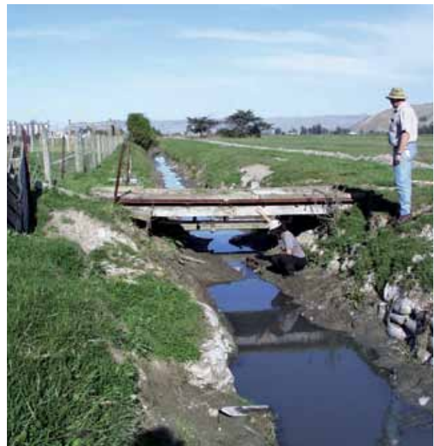
Wairau Plain drainage channel

The dramatic expansion of viticulture on the Wairau Plain has started to put pressure on the drainage network. For example, there has been some demand to expand or enhance the drainage network to provide for recent viticulture conversions in areas where high groundwater tables have been encountered. There has also been anecdotal evidence of increased runoff from land used for viticulture. This could possibly be caused by soil compaction from the high vehicle movements between rows.