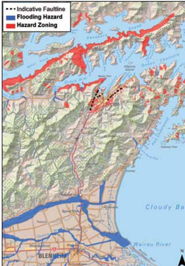
FIGURE 14.2: HAZARD MAP

potential for exceptional flood events to breach these defences is also recognised. The Wairau/Awatere Plan seeks to avoid intensive development in areas likely to be susceptible to such extreme events. Maps are used to define the extent of the flood hazard.