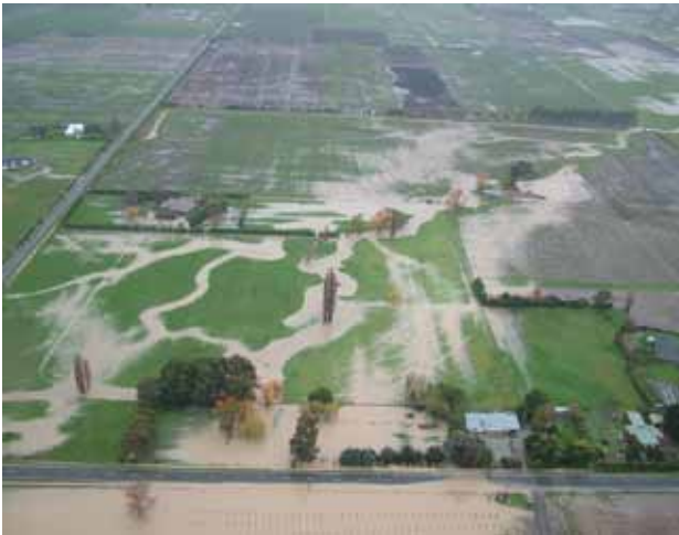
Doctors Creek flooding, August 2008