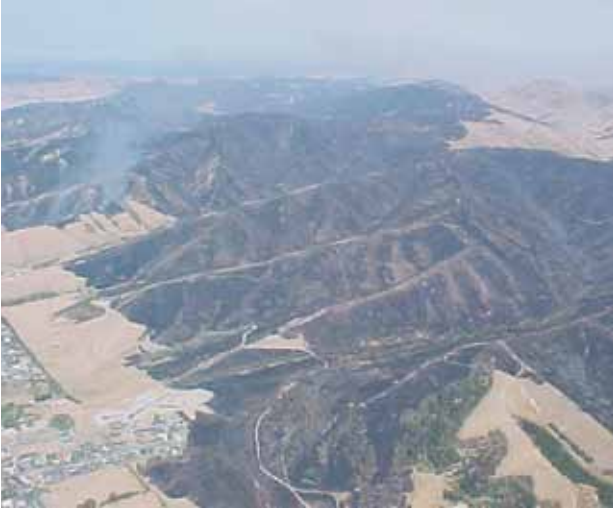
Boxing Day fires - Wither Hills overview

By world standards, the frequency of thunderstorms in New Zealand is low. Marlborough has 5 to 10 days of thunderstorm activity per year with Blenheim having 3 thunderstorm days per year on average. Once in 50 years the district can expect up to 15 days of thunderstorm activity.