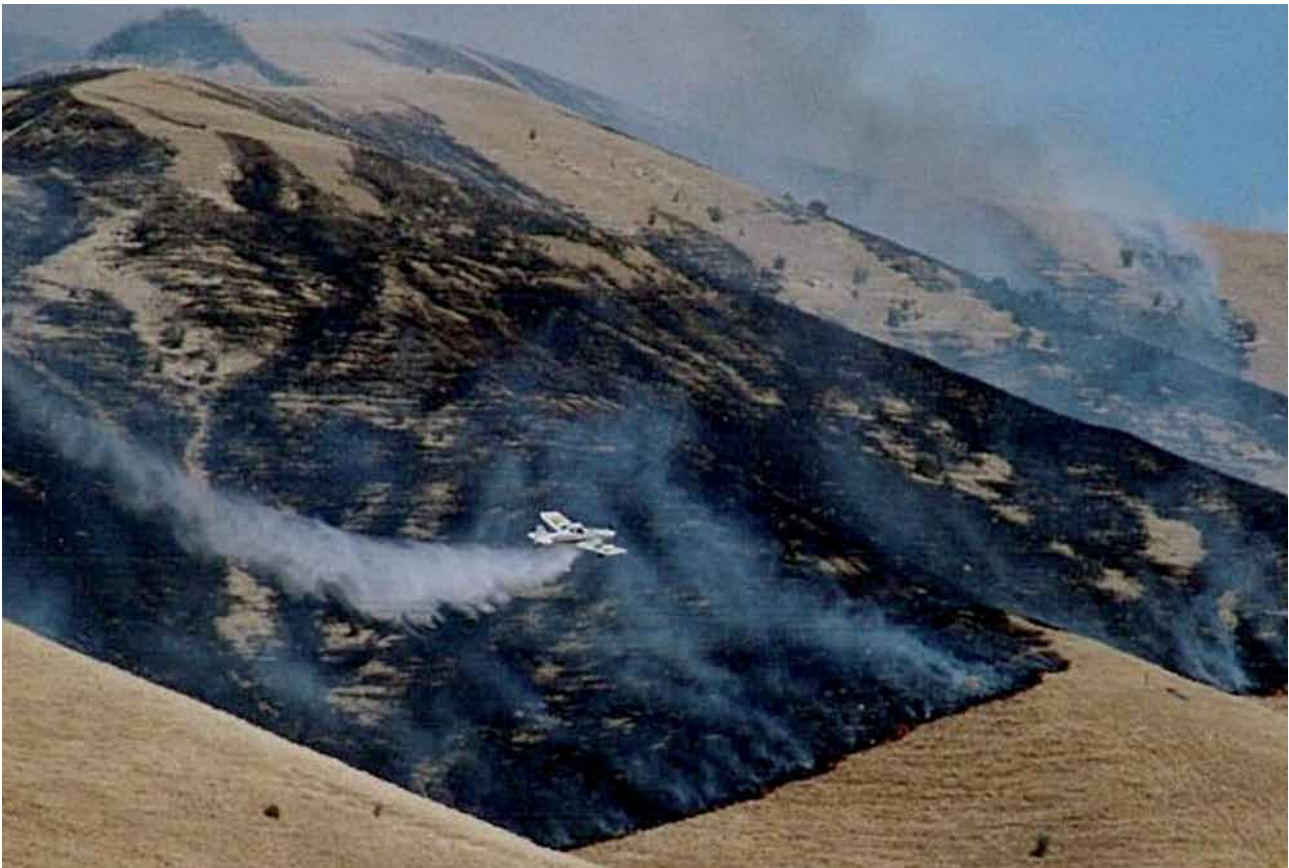
Wither Hills fire control

A summary of the data is also recorded on the Council's River and Flood Infoline answer phone system, phone: +64 (0)3 520 7488. The Infoline gives up-to-date river levels and recent rainfall from the Council's recorders throughout Marlborough, so as to warn of probable flooding.