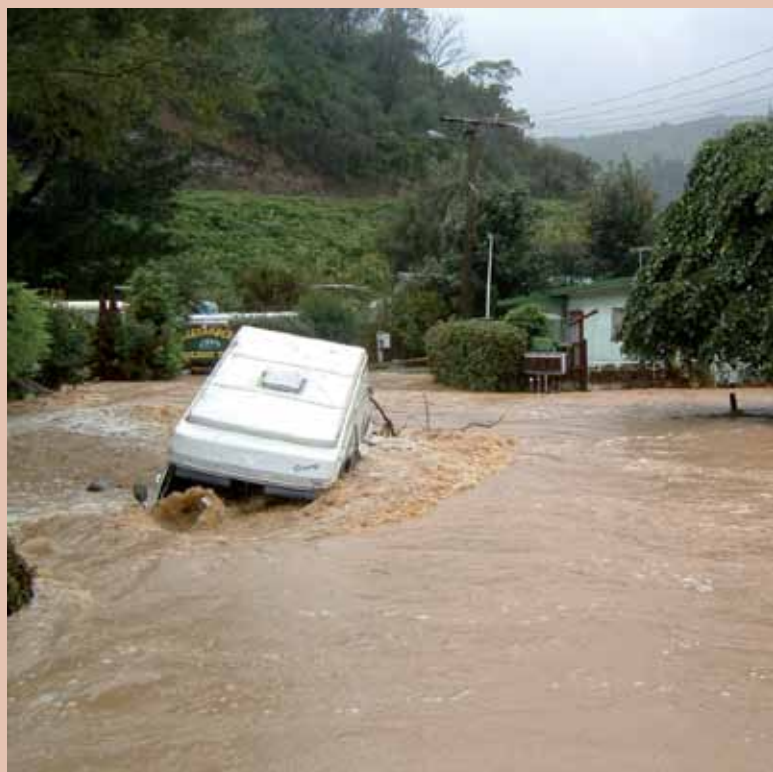
Waitohi Stream at Alexander's Holiday Park

The Graham River, in Whatamango Bay, experienced extreme flooding and debris flows during the event. The River is not protected by floodworks and escaped its banks across a wide floodplain and overtopped the road. A caravan parked within the floodway was washed away but the only dwelling within the floodway was raised high enough to avoid being damaged.