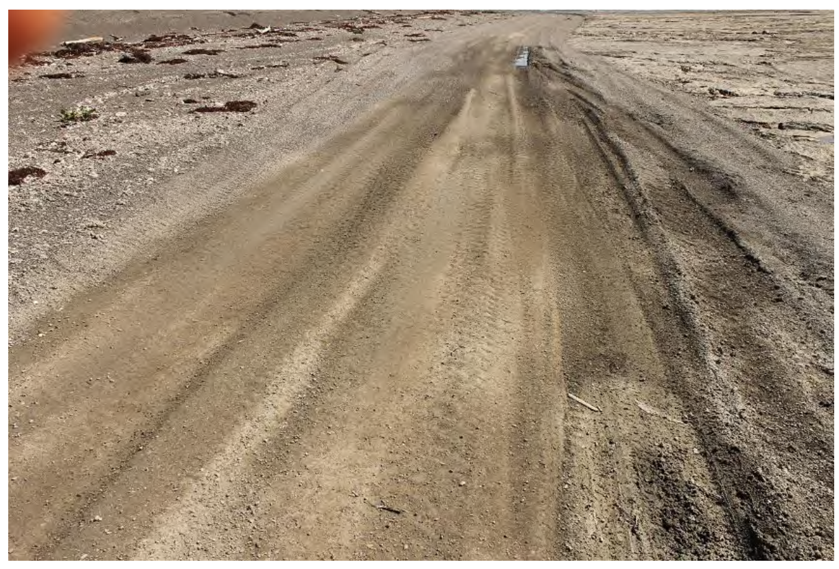
Figure 29: Compacted vehicle tracks along the beach south of Cape Campbell.

49. Figure 30 below shows numerous vehicle tracks driving along the beach, with one track veering off up into the dunes to the right.