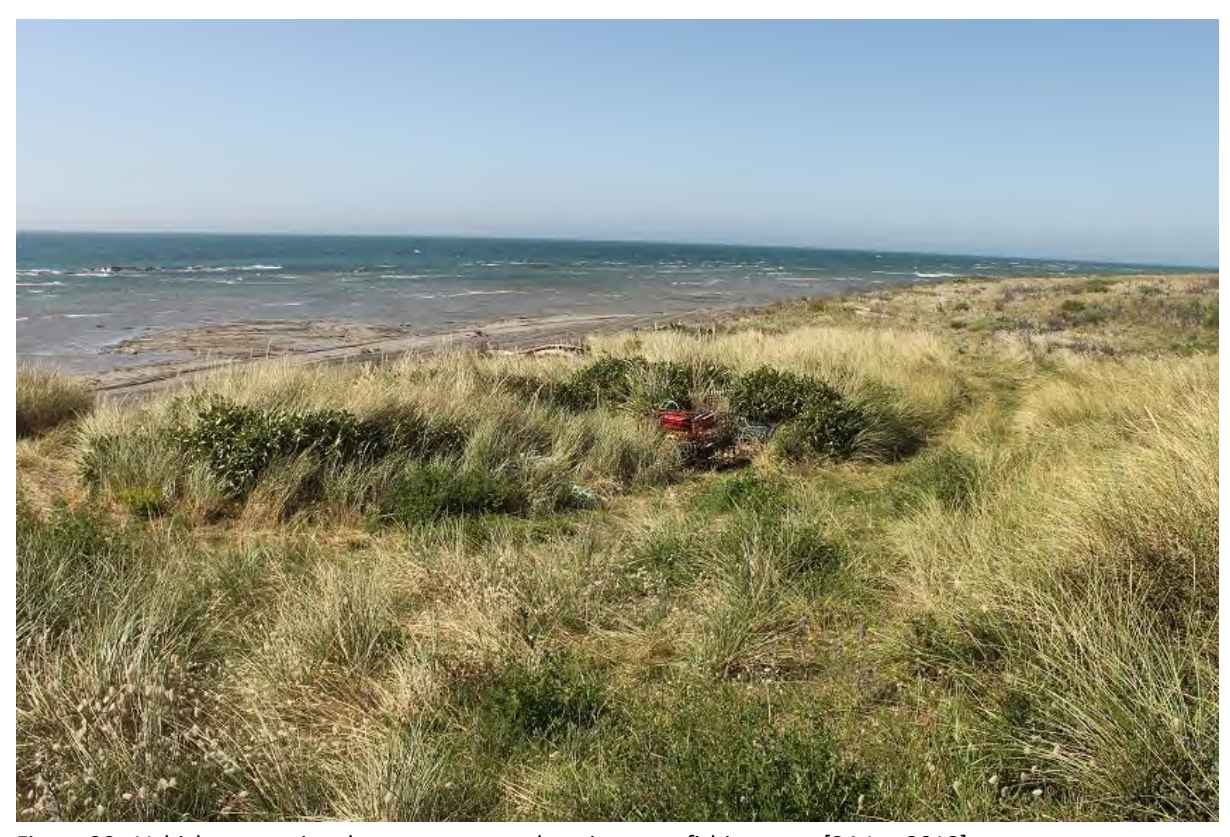
Figure 39: Vehicles accessing dunes to store and retrieve crayfishing pots. [24 Jan 2018]

58. Figure 39 below shows that regular and ongoing damage has been caused by driving up and over these dunes (probably by quad bike) to access the craypots.