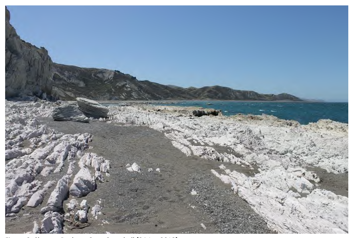
Figure 6: Chancet Rocks to Cape Campbell [24 Jan 2018]

16. Figure 6 shows the extensive coastline looking northwest from Chancet Rocks scientific reserve towards Long Point and then onto Cape Campbell in the far distance.