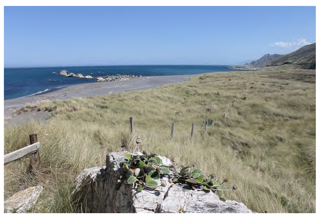
Figure 10: Chancet Bay looking south [24 Jan 2018]

20. Figure 10 below is standing on the south side of the Chancet Rocks looking down towards Ward Beach and on to the Needles. The row of rocks out to sea encloses the south end of Chancet Bay, mirroring a similar row of rocks to the north (just out of view).