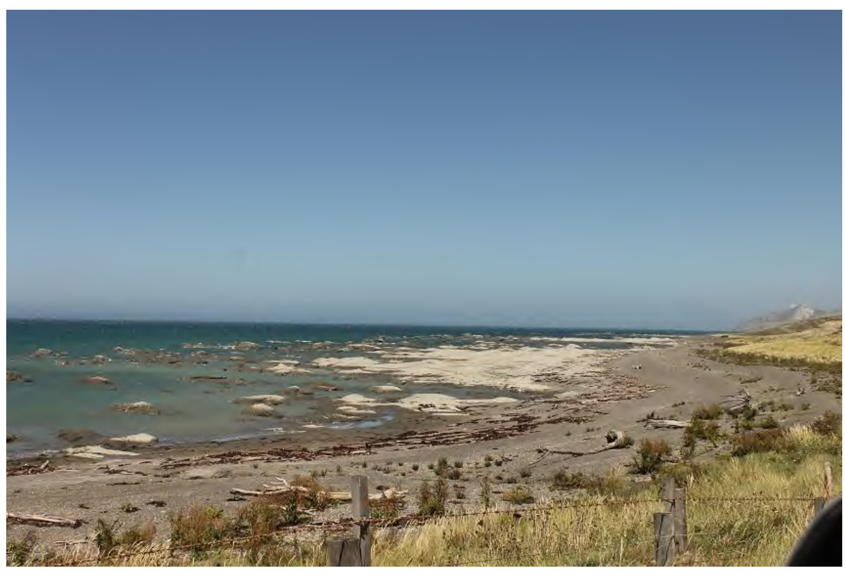
Figure 5: Looking from Cape Campbell airstrip south towards Chancet Rocks [24 Jan 2018]

16. Figure 6 shows the extensive coastline looking northwest from Chancet Rocks scientific reserve towards Long Point and then onto Cape Campbell in the far distance.