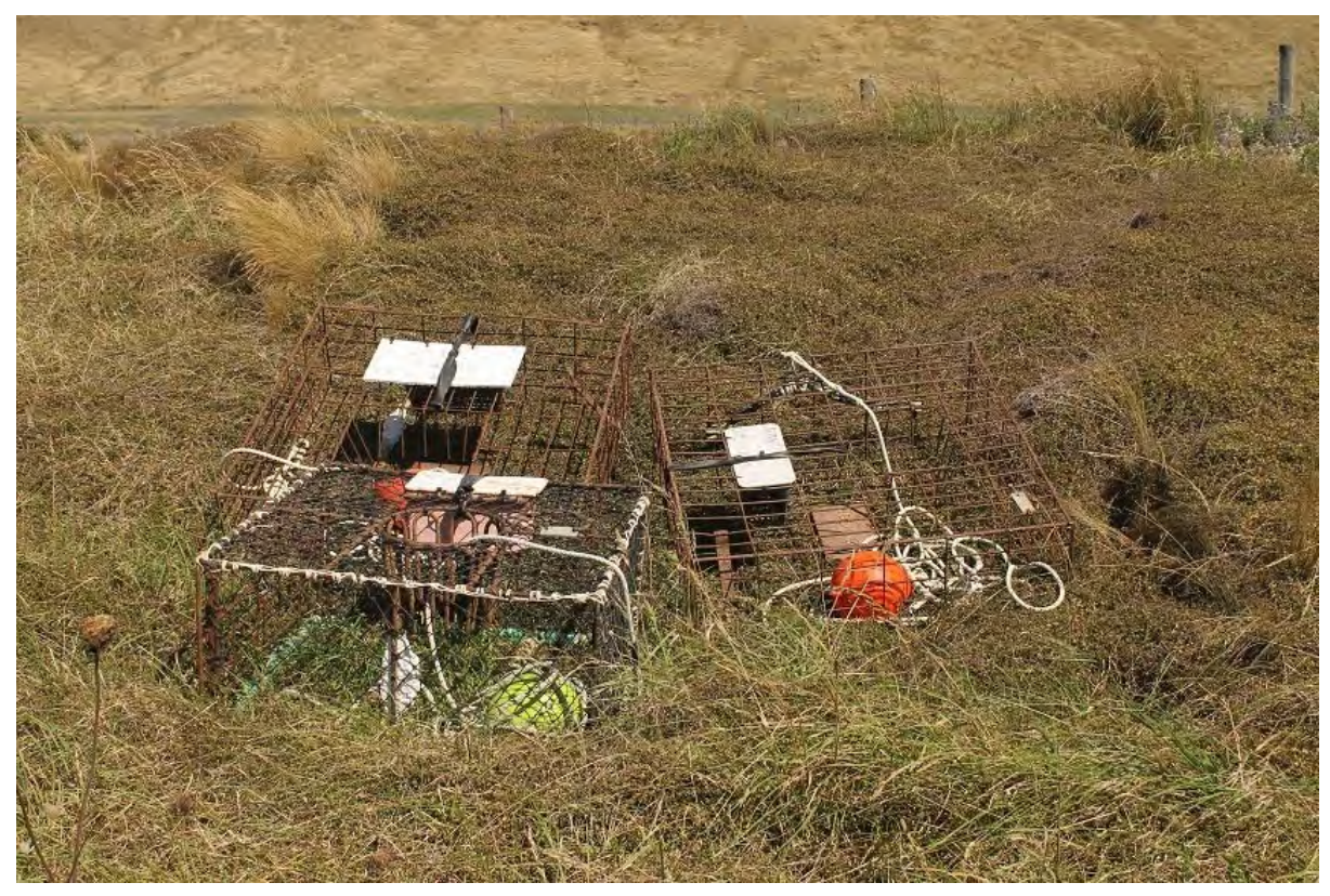
Figure 38: Craypots on native vegetation on dunelands above the beach. [24 Jan 2018]

58. Figure 39 below shows that regular and ongoing damage has been caused by driving up and over these dunes (probably by quad bike) to access the craypots.