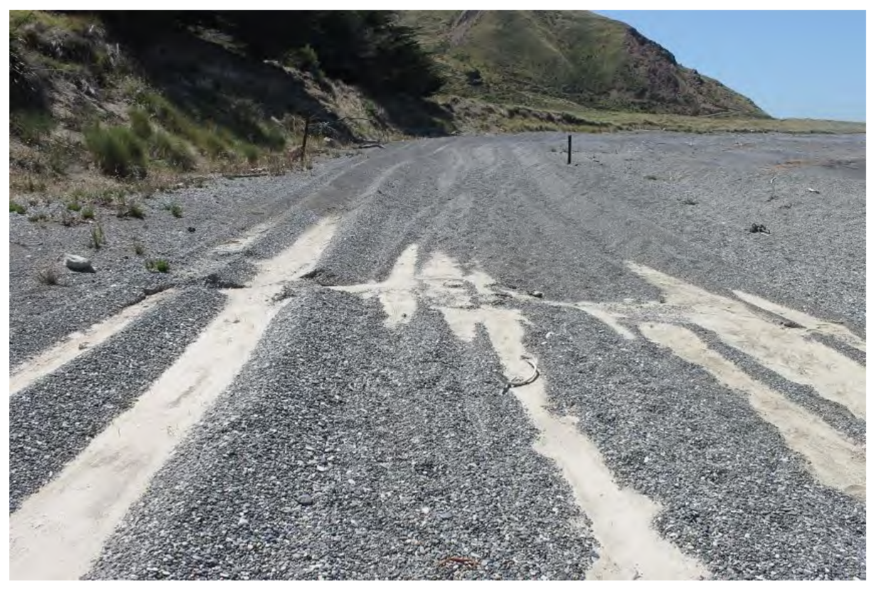
Figure 32: Tyre tracks filled with silt laden stormwater that had set. [24 Jan 2018]

52. Figure 33 shows the deep furrows caused by vehicle tracks moving through the deep pea gravels north of Ward Beach. These areas are habitat for banded dotterel, and during an earlier visit in December, several birds were noted running around this area.