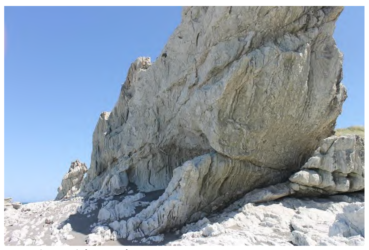
Figure 7: Chancet Rocks [24 Jan 2018]

17. Figure 7 shows part of the internationally significant Chancet Rocks scientific reserve and geopreservation site. The site is ranked A: internationally important with a vulnerability index of 1: vulnerable to complete destruction by human activity<sup>3</sup>. The photo is taken looking south east from the northern most point of the largest tilted rock.