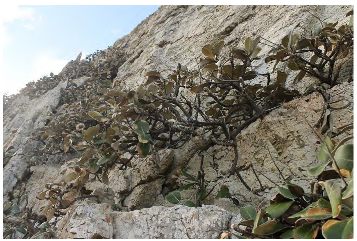
Figure 20: Marlborough Rock Daisy Pachystegia insignis [23 Jun 2017]

31. Figure 20 shows the iconic Marlborough rock daisy growing over the Chancet Rocks, finding sufficient nutrients within the cracks.