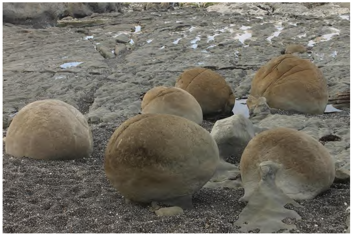
Figure 16: Concretions at Ward Beach [23 Jun 2017]

27. Figure 16 below shows what has now become known as the "mini Moeraki" boulders. These arise in the sedimentary pavements and are known as 'concretions'. They emerge over time as the softer pavements erode.