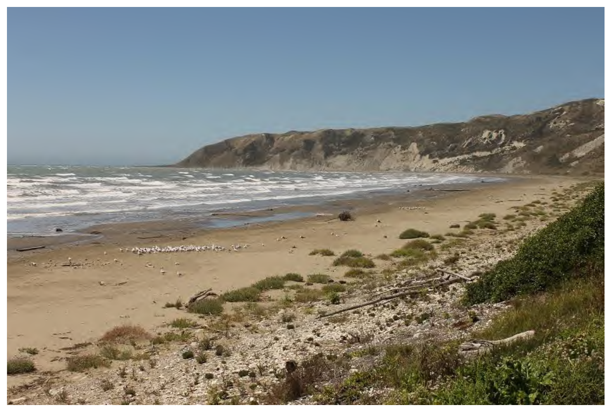
Figure 2: From Department of Conservation site at Marfells Beach looking toward Mussel Point. [24 Jan 2018]

13. Figure 3 shows the view from Cape Campbell as it sweeps around Clifford Bay towards Mussel Point and on to Marfells Beach.