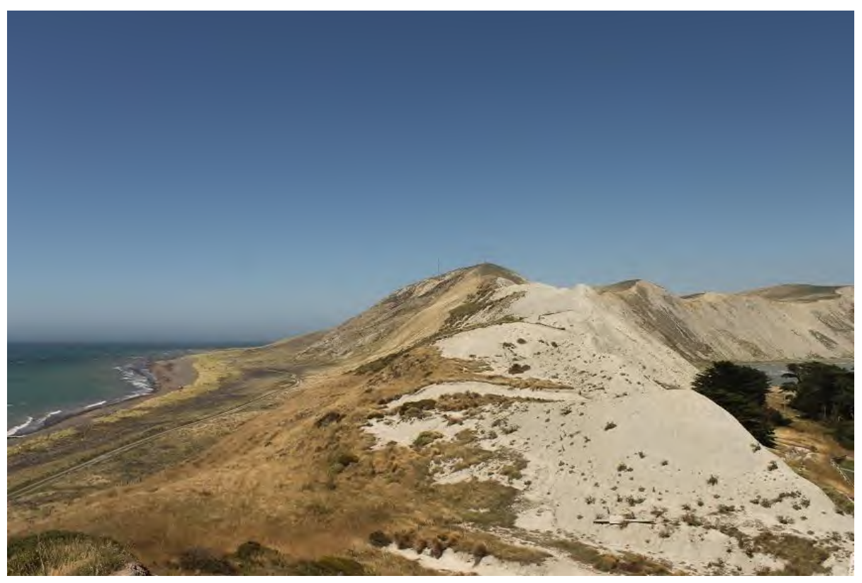
Figure 4: View from Cape Campbell looking south west across the limestone based geologies [24 Jan 2018].

14. Figure 4 below is taken from the southern side of the Lighthouse looking south, showing the coastline in both directions and the landscapes forming part of the "Limestone Coastline" as described in Boffa Miskell (2015)<sup>1</sup>. Three sites within the Limestone Coastline are identified in the New Zealand Geopreservation Inventory, and referred to by Boffa Miskell: Needles Point Cretaceous-Tertiary Boundary, Flaxbourne River folds and thrusts, and the Chancet Rocks<sup>2</sup>.