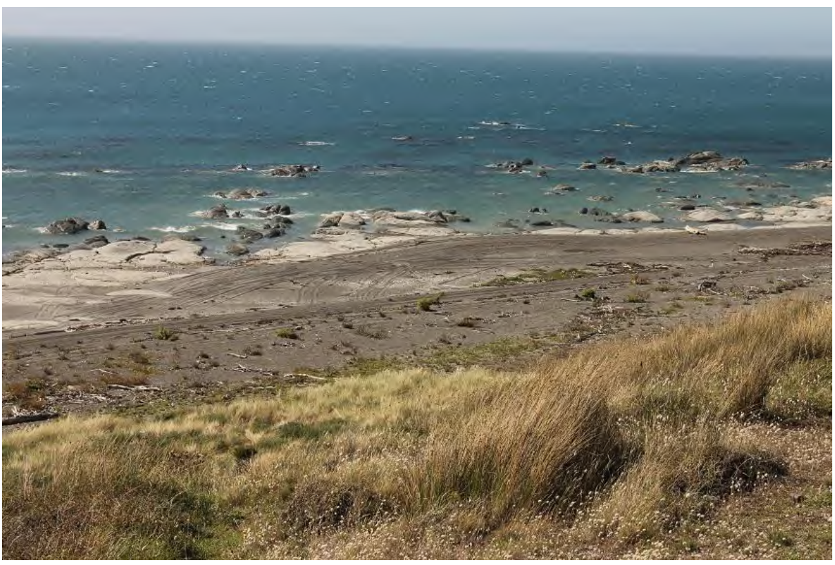
Figure 27: Beach north of Canterbury Gully showing numerous tyre tracks. [24 Jan 2018]

47. Figure 28 below shows tyre marks evident across the full beach profile.