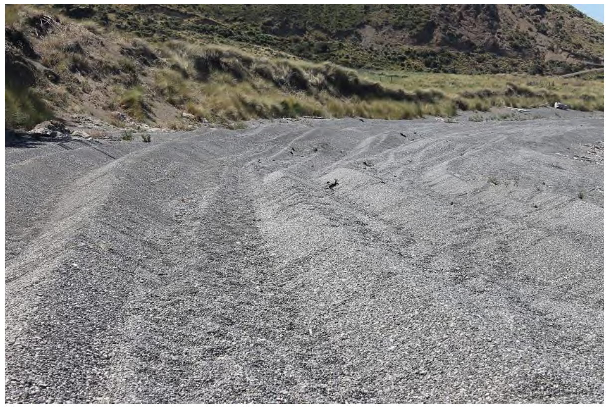
Figure 33: Deep vehicle tracks in pea gravels north of Ward Beach. [24 Jan 2018]

52. Figure 33 shows the deep furrows caused by vehicle tracks moving through the deep pea gravels north of Ward Beach. These areas are habitat for banded dotterel, and during an earlier visit in December, several birds were noted running around this area.