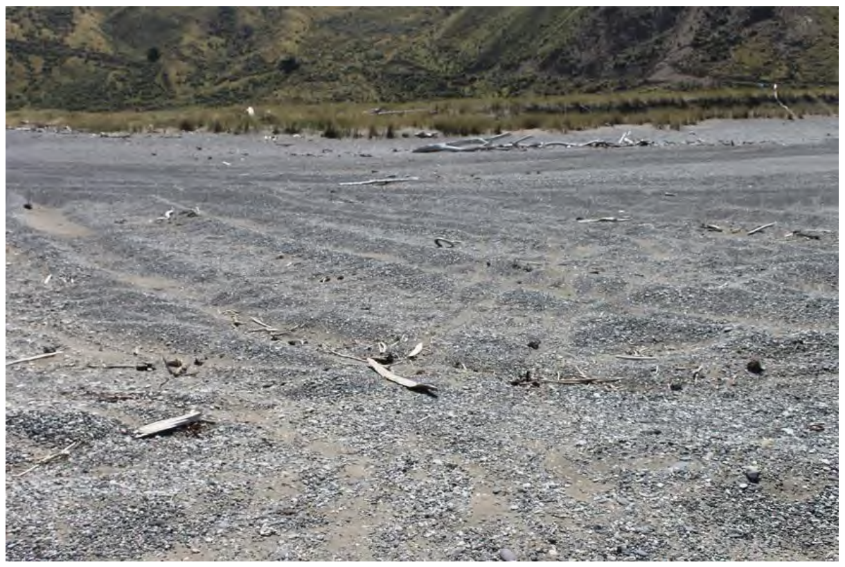
Figure 34: Tyre tracks at Chancet Bay [24 Jan 2018]

53. Figure 34 below the criss-crossing of many tracks where the beach widens at Chancet Bay. This is above the Mean High Water Springs.