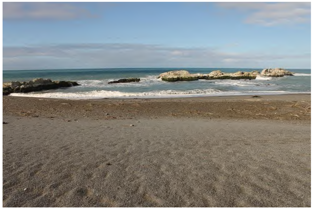
Figure 9: Chancet Bay Beach and out towards rocks [23 Jun 2017]

19. Figure 9 below shows the Chancet Rocks formation as it continues out into the sea.