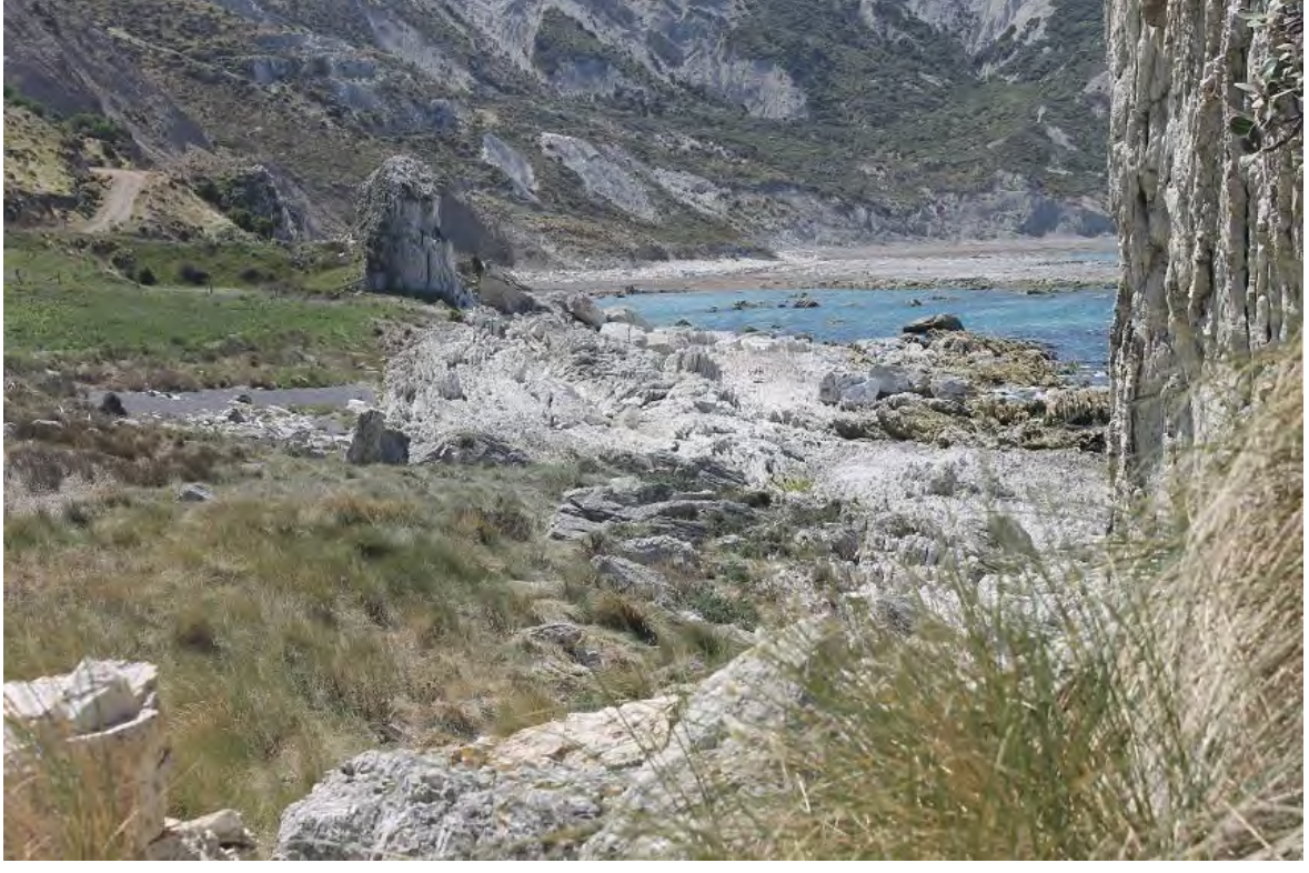
Figure 19: NZ fur seal resting area at Chancet Rocks reserve. [24 Jan 2018]

30. Figure 19 is looking northwest alongside the larger of Chancet Rocks. Flattened grass just above the rocks indicates the site being used by fur seals as a resting area. Seals can often be seen high around these rocks.