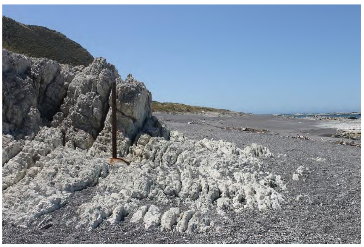
Figure 40: Sign previously supporting the community request for walking access removed. [24 Jan 2018]

59. Finally, tensions over access have resulted in the removal of the three signs at Ward Beach asking for Walkers Only. This sign was removed sometime between 14 December 2017 (figure 26) and 24 January 2018 (figure 40 below).