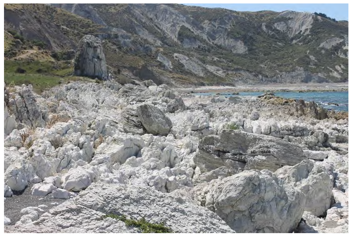
Figure 8: Taken from within Chancet Rocks scientific reserve looking northwest. Notice native iceplant growing on the rocks in the foreground. [24 Jan 2018]

19. Figure 9 below shows the Chancet Rocks formation as it continues out into the sea.