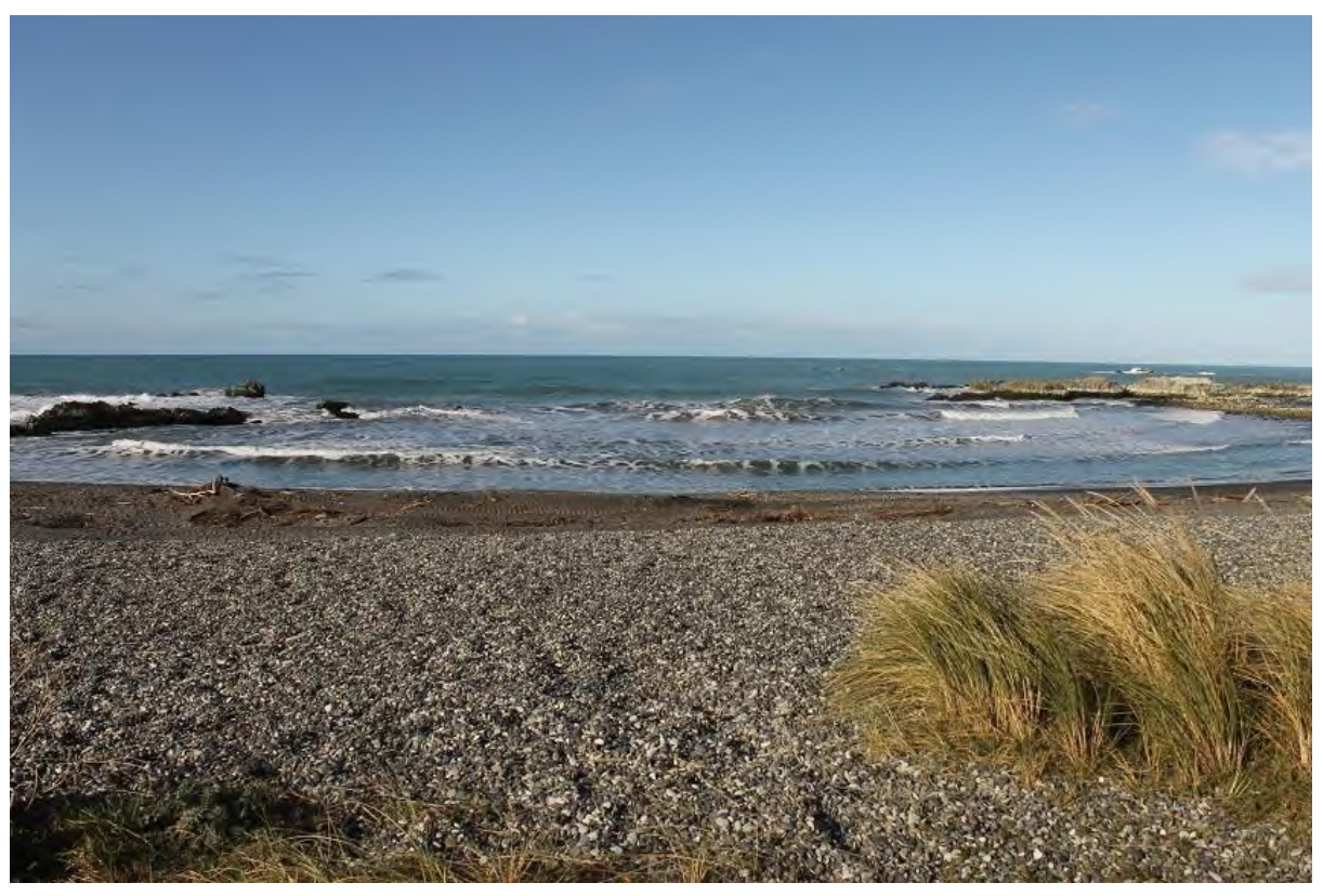
Figure 14: Ward Beach [23 Jun 2017]