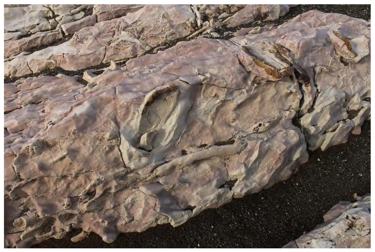
Figure 15: Detail of rocks within the Chancet Rocks Scientific Reserve [23 Jun 2017]

27. Figure 16 below shows what has now become known as the "mini Moeraki" boulders. These arise in the sedimentary pavements and are known as 'concretions'. They emerge over time as the softer pavements erode.