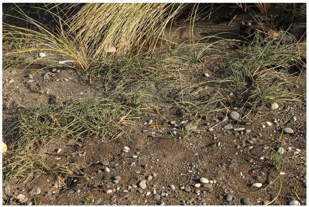
Figure 23: Sand sedge Carex pumila along Ward Beach [23 Jun 2017]

34. The margins between the gravels, dunes, and beach often give rise to other small native New Zealand plants like the sand sedge in Figure 23 below.