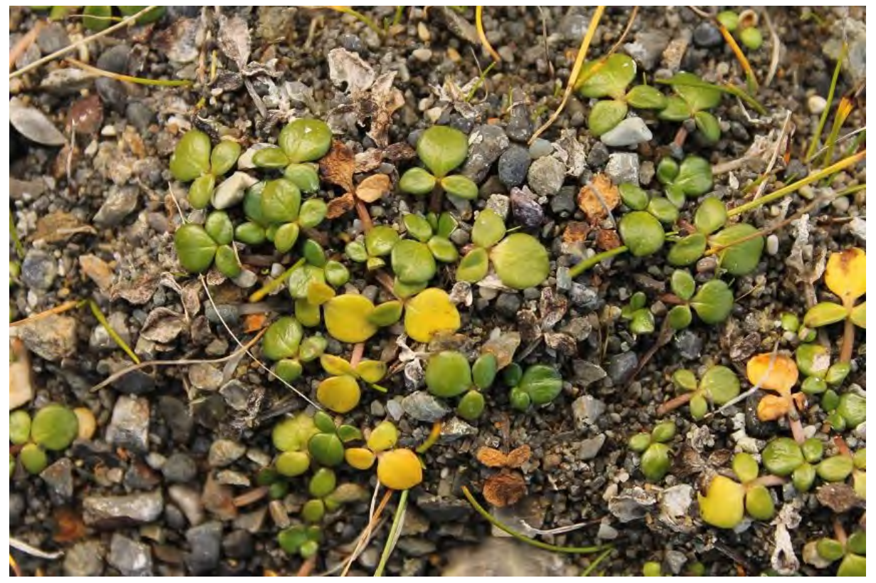
Figure 25: Shore buttercup Ranunculus acaulis

36. Finally, one of the smallest plants on the shoreline, with a preference for moist light gravel areas is the shore buttercup, whose tiny leaf clusters are smaller than a fingernail (figure 25). They are not common along the Marlborough coast.