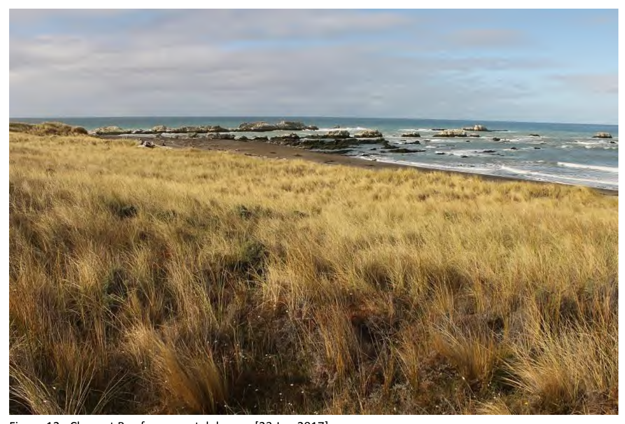
Figure 12: Chancet Bay from coastal dunes. [23 Jun 2017]

22. Figure 12 below is on the dunelands looking north back towards Chancet Bay with the two rows of rocks forming the bay clearly visible. The dunelands in this area are part of the conservation zone, with an unformed legal road running through the dunes.