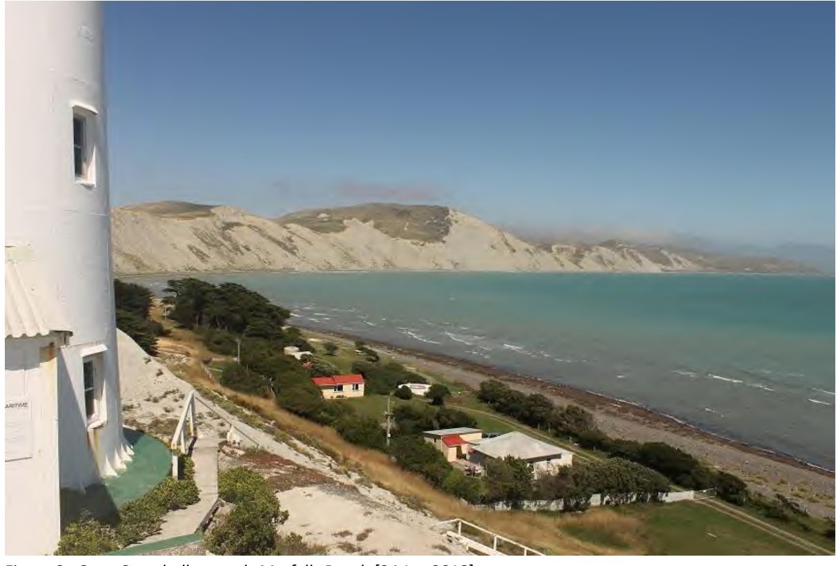
Figure 3: Cape Campbell towards Marfells Beach [24 Jan 2018]

13. Figure 3 shows the view from Cape Campbell as it sweeps around Clifford Bay towards Mussel Point and on to Marfells Beach.