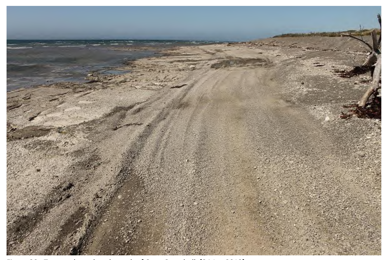
Figure 30: Tyre tracks on beach south of Cape Campbell. [24 Jan 2018]

49. Figure 30 below shows numerous vehicle tracks driving along the beach, with one track veering off up into the dunes to the right.