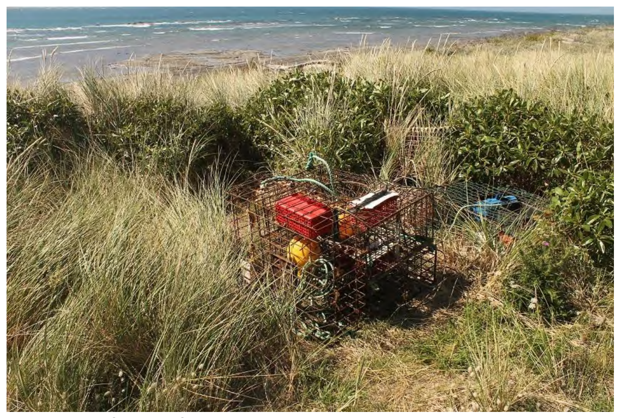
Figure 37 Craypots [24 Jan 2018]

56. Figure 37 below shows craypots hidden in the dune vegetation just south of Cape Campbell.