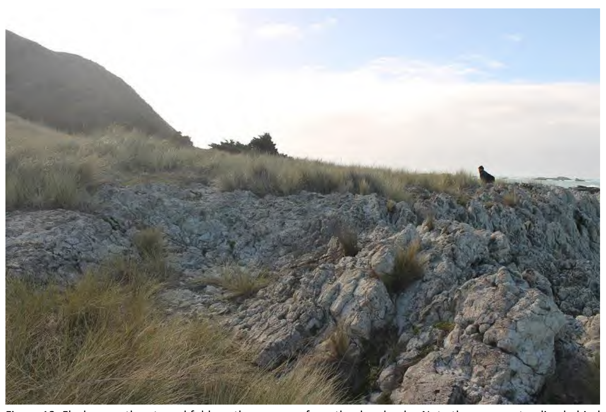
Figure 13: Flaxbourne thrusts and folds as they emerge from the dunelands. Note the person standing behind on the dunes for scale. [23 Jun 2017]

23. Figure 13 below shows part of the geopreservation site listed in the landscape report prepared for the Marlborough Environment Plan. The site is identified as the Flaxbourne River folds and thrusts<sup>5</sup>. It is ranked as C for importance (i.e. regionally important); and the vulnerability is ranked as 3, i.e. probably not vulnerable to any likely human actions. However, an unformed legal road is mapped across this geological feature.