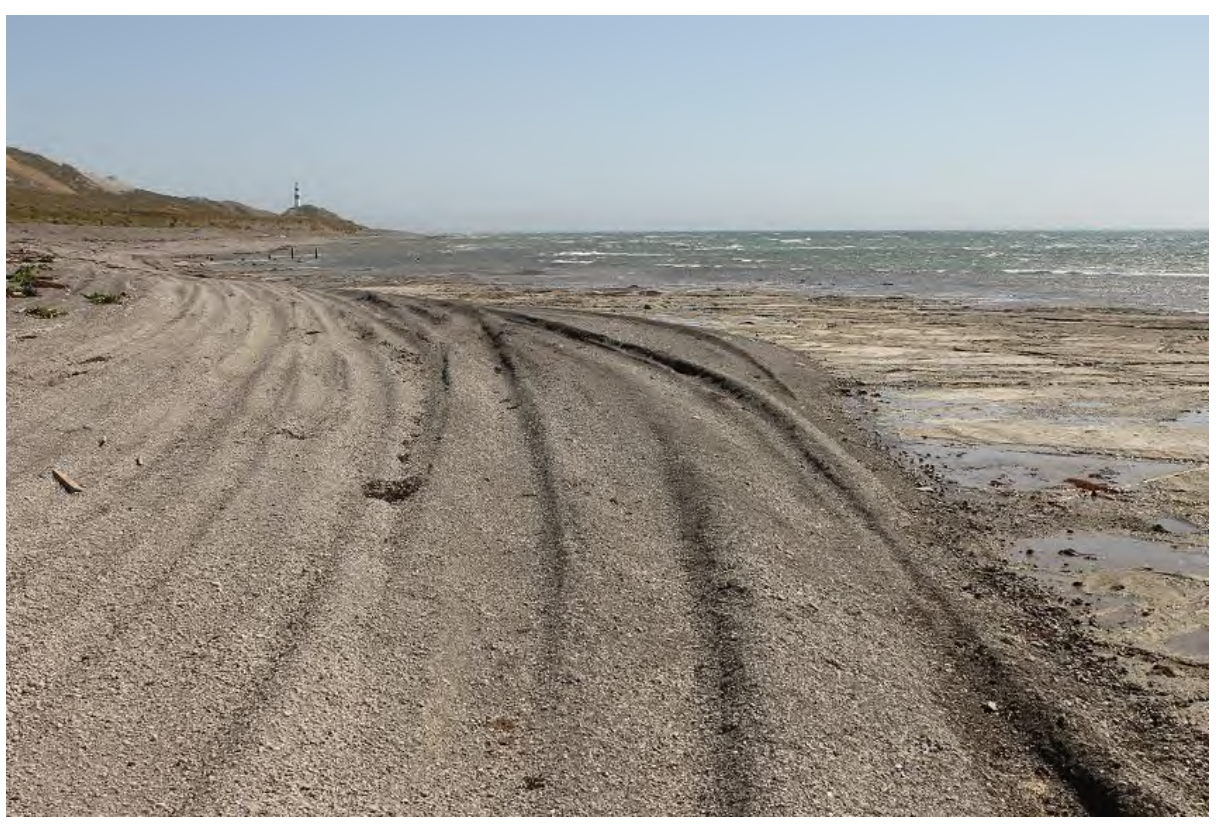
Figure 31: Tyre tracks in beach approaching Cape Campbell. [24 Jan 2018]

50. Figure 31 below shows deeper and larger tracks as they move around the foreshore and across the pea gravels overlying rock pavements. The lighthouse of Cape Campbell is in the distance.