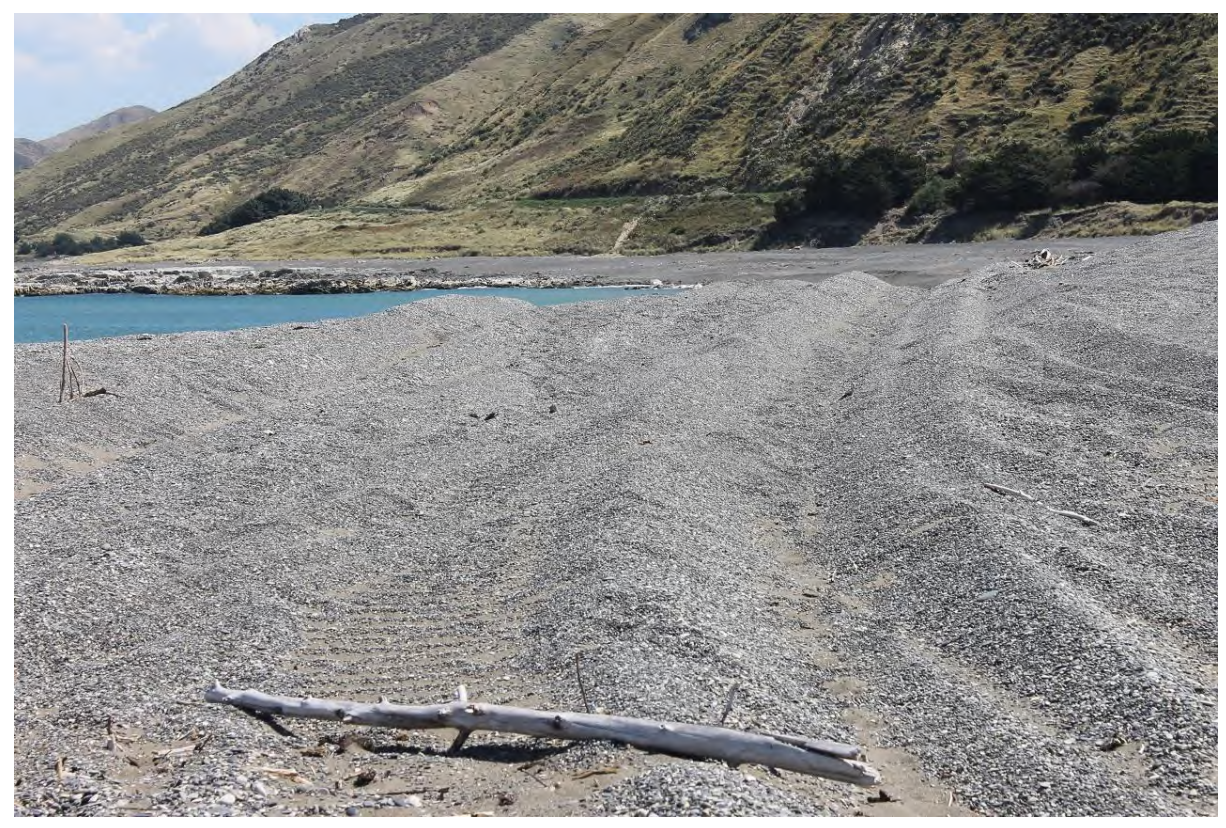
Figure 35: Deep tyre tracks at Chancet Bay. [24 Jan 2018]

55. Figure 36 below shows a well laden 4WD going along Marfells Beach. I viewed the vehicle travelling possibly around 50km/hour until it disappeared out of view around Mussel Point where it drove up over the low headland.