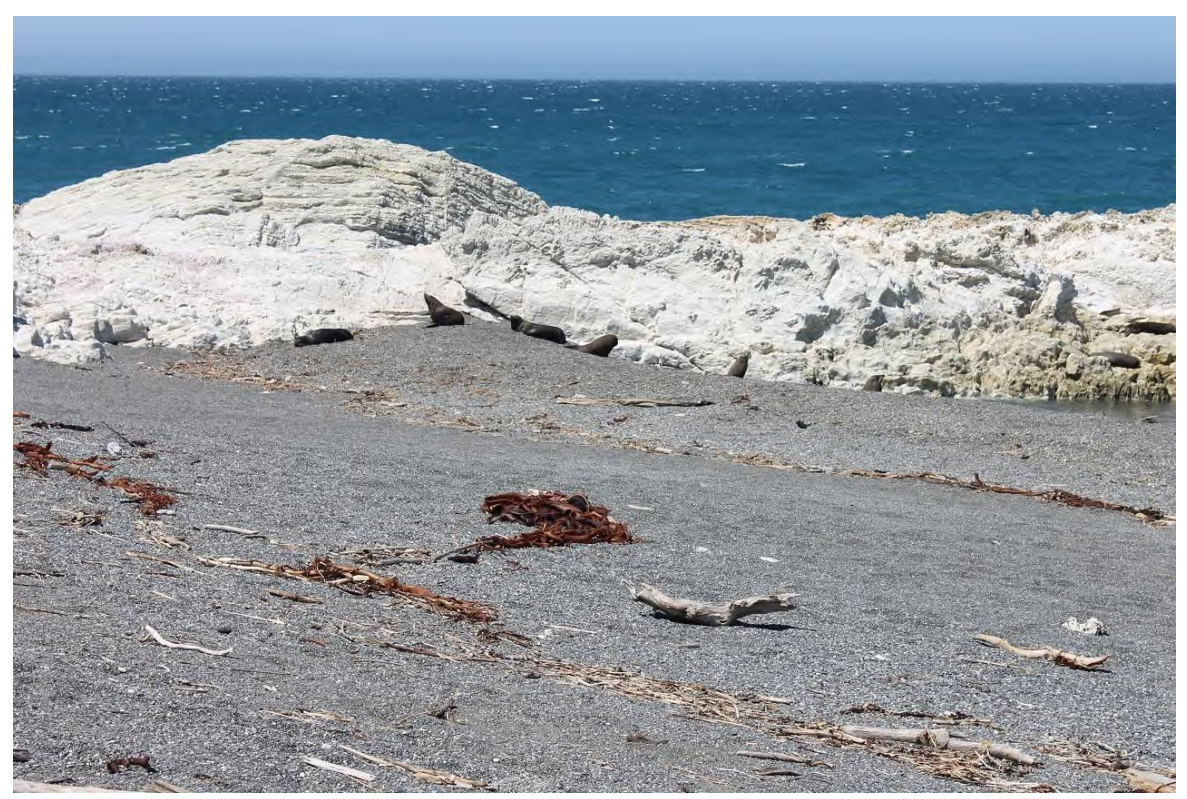
Figure 18: NZ fur seals within Chancet Bay. Notice some resting on the rocks to the right of the picture. [24 Jan 2018]

30. Figure 19 is looking northwest alongside the larger of Chancet Rocks. Flattened grass just above the rocks indicates the site being used by fur seals as a resting area. Seals can often be seen high around these rocks.