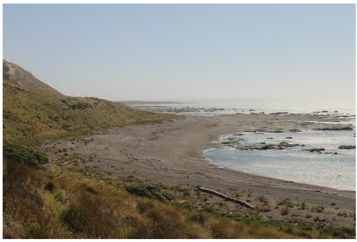
Figure 28: Photo looking north towards the Cape Campbell airstrip showing tyre tracks across the beach profile. [24 Jan 2018]

48. Figure 29 is taken from the point immediately in the foreground in photo 28, and shows the deep tyre tracks being formed by continuous vehicle use along the foreshore. The tyres are causing compaction, change in drainage patterns, and are affecting the natural profile and landscape of the beach. It has the impression of a road.