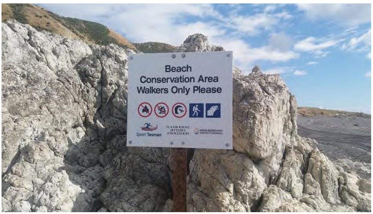
Figure 26: Sign at Ward Beach encouraging walkers only. [14 Dec 2017]