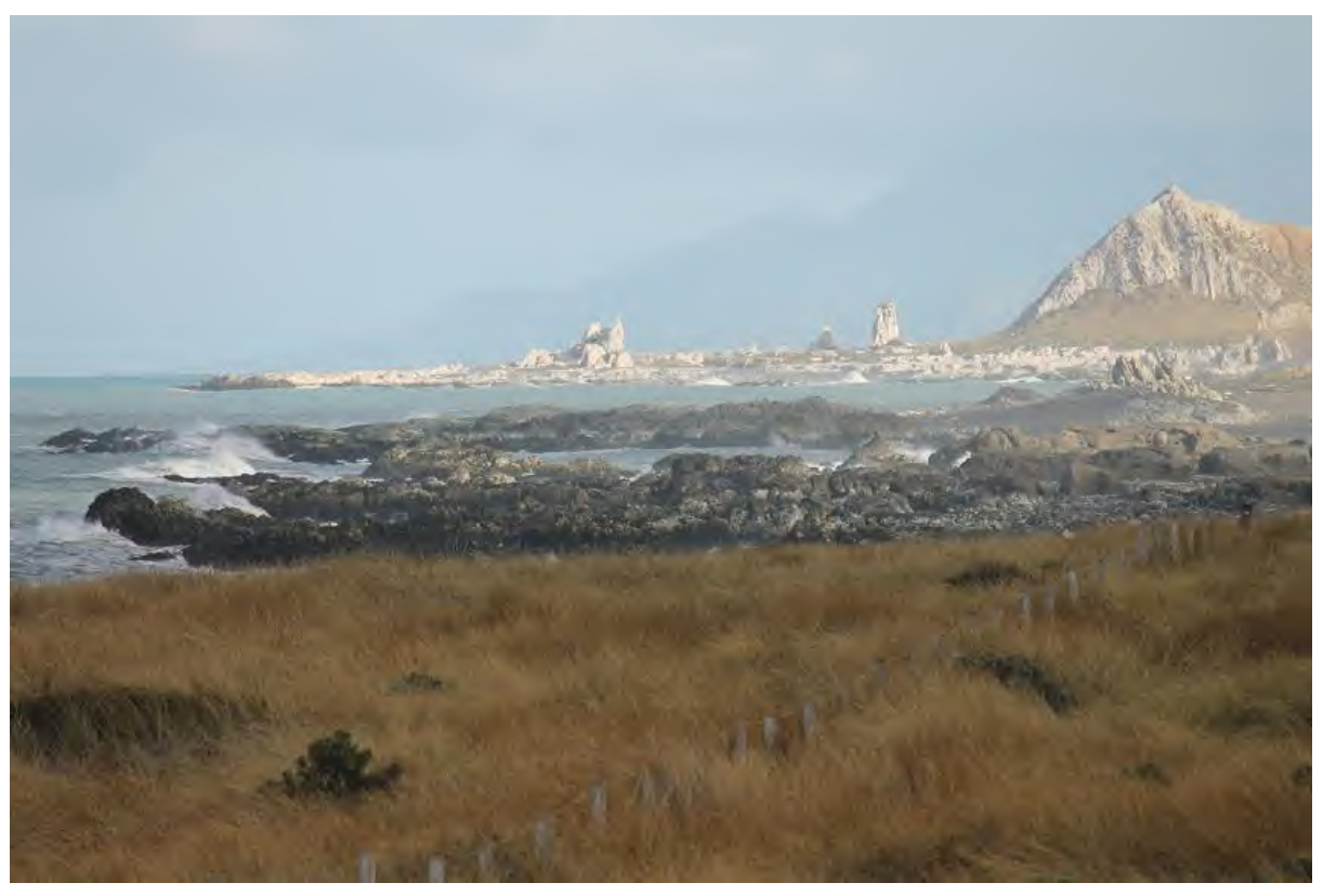
Figure 11: The Needles from Chancet Rocks [23 Jun 2017]

22. Figure 12 below is on the dunelands looking north back towards Chancet Bay with the two rows of rocks forming the bay clearly visible. The dunelands in this area are part of the conservation zone, with an unformed legal road running through the dunes.