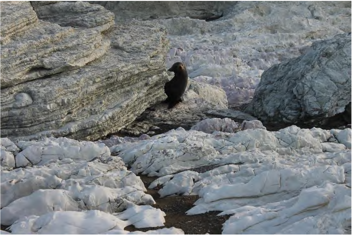
Figure 17: New Zealand fur seal at Chancet Rocks scientific reserve. [24 Jan2018]

28. Figure 17 shows a New Zealand fur seal just emerging from behind a rock within the Chancet Rocks reserve. Fur seals are known to frequent this area as a safe haul out and resting site. From personal observation the number of fur seals vary at each visit, but on each occasion I have always 'surprised' one resting under one of the larger rock shelves.