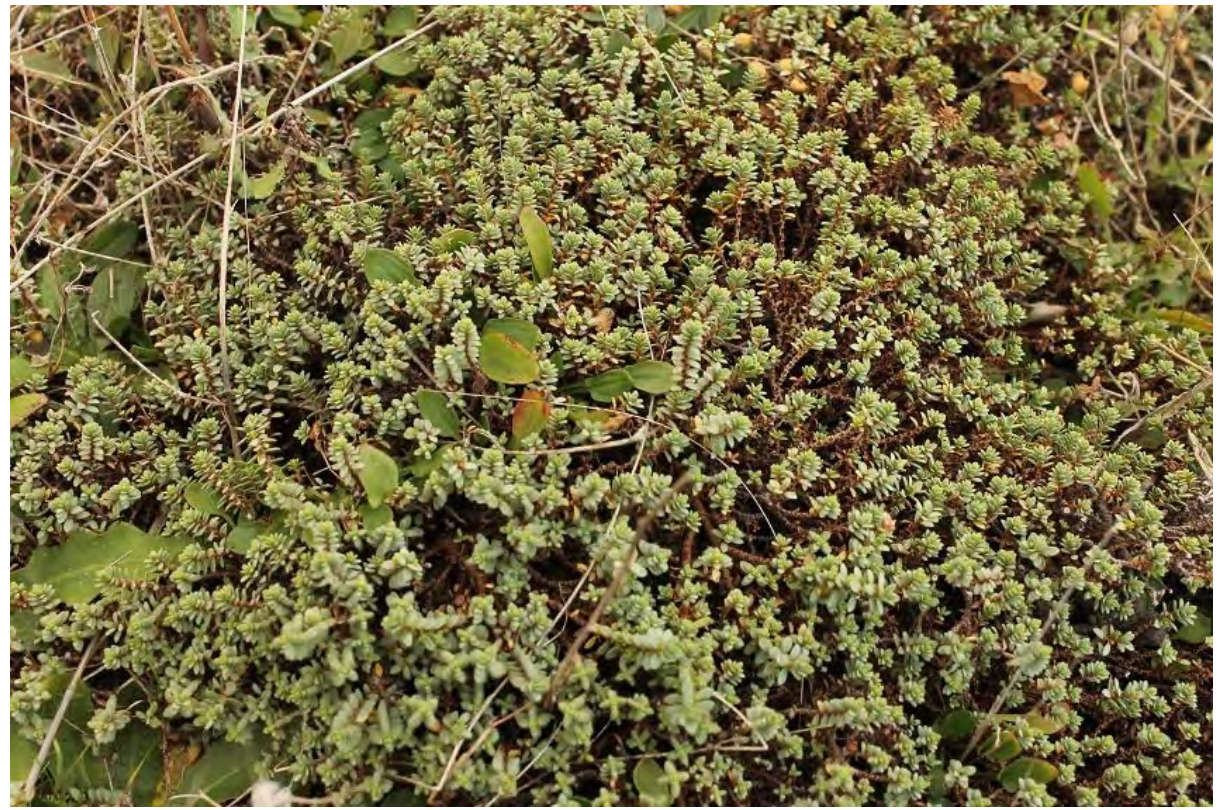
Figure 21: NZ daphne Pimelea prostrata [23 Jun 2017]

33. Figure 22 shows the complexity of the dune ecosystem with Shrub daisy ( Olearia solandri ), tauhinu ( Ozothamnus leptophylus ), and coastal flax ( Phormium cookianum ) all visible within a hollow in the marram dominated duneland off the Chancet Beach – again within the footprint of an unformed legal road.