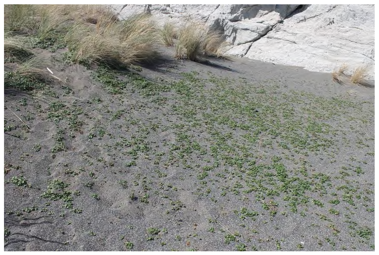
Figure 24: New Zealand shore bindweed Calystegia soldanella

36. Finally, one of the smallest plants on the shoreline, with a preference for moist light gravel areas is the shore buttercup, whose tiny leaf clusters are smaller than a fingernail (figure 25). They are not common along the Marlborough coast.