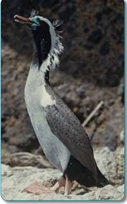
Spotted shag (DOC)

total population is thought to be less than 30,000 breeding pairs<sup>365</sup>. number of breeding colonies in the Sounds has trebled over the last thirty years<sup>47</sup>. During 2006, Bell (pers. comm.) recorded 1254 breeding pairs in the Marlborough Sounds. Relatively few spotted shags breed in Tasman Bay and Golden Bay (to the west of the Sounds) but numbers increase dramatically there over the winter months.