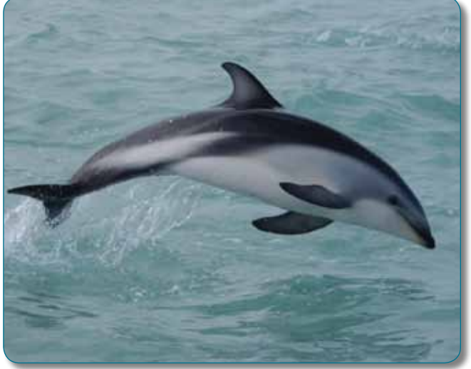
epresents a significant portion of the New Zealand dusky been the focus of continued scientific interest regarding the

Admiralty Bay is now recognised as an important feeding area for some overwintering dolphins that are found off Kaikoura during the summer<sup>373</sup>. Feeding in Admiralty Bay occurs during daylight hours, with primary targets being small schooling fishes e.g. pilchards<sup>390</sup>. Feeding behaviour is highly coordinated, with dolphins herding fish into bait balls, often during multi-species feeding bouts with other species including fur seals, gannets, and shearwaters<sup>372,373</sup>.