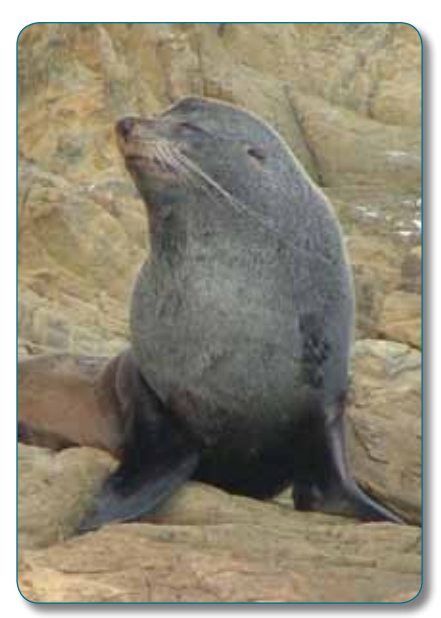
Fur seals (MDC above, DOC below)