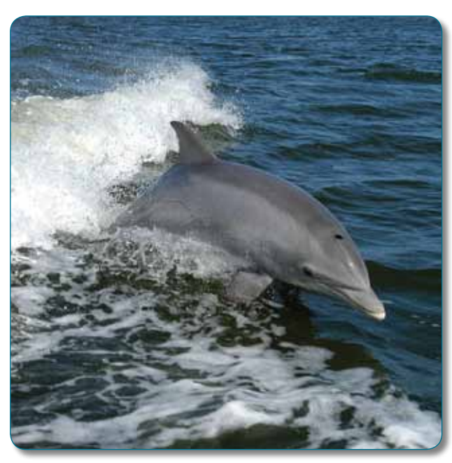
Bottlenose dolphin

Bottlenose dolphin is a significant species in Marlborough on conservation grounds. Marlborough is one of the three important population centres for this species in New Zealand. This species is classified as "nationally endangered" in New Zealand waters<sup>398</sup>.