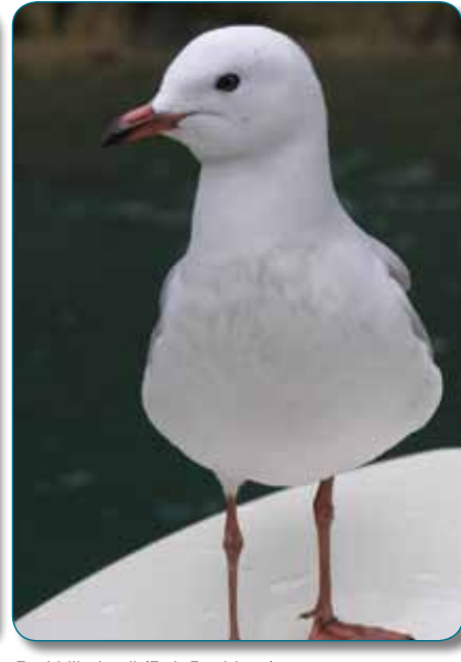
Red-billed gull (Rob Davidson)