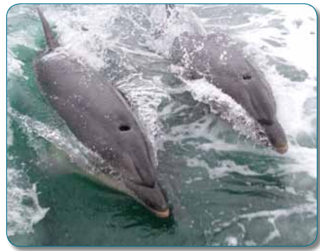
Bottlenose dolphin (MDC)

Bottlenose dolphins are a large and robust dolphin (up to 3.5m) with a short to moderate-length beak. They are grey-black on their backs and sides, fading to white on the belly. The dorsal fin is tall and swept back.