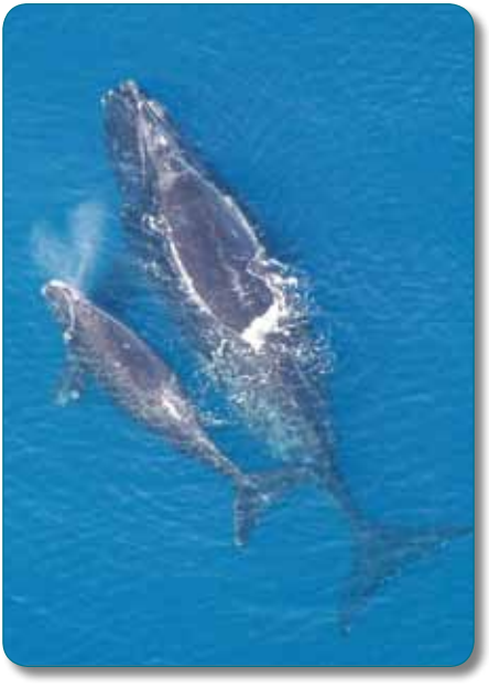
Southern right whale (Nyla Strachan)