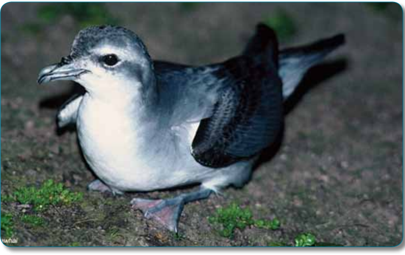
Fairy prion (DOC)

The fairy prion is a small seabird with blue-grey upper parts and a characteristic black line zig-zagging across the wings and body, while its underparts are pale. It is usually seen in flocks at sea where the flight is erratic and close to the water surface.