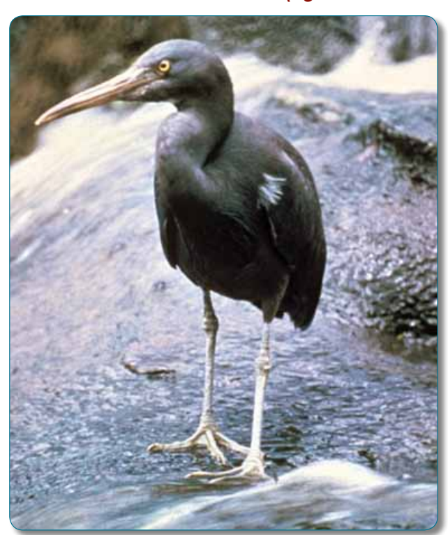
Reef Heron (DOC)

Reef heron are a uniform slate grey coloured bird with distinctive yellowish bill and legs. They reach up to 66 centimetres in length and have a wingspan of between 90 and 110 centimetres. When stalking prey over coastal reefs or shoreline the bird adopts a hunched posture with its wings stretched forward. The flight is deliberate with slow wing beats, keeping the bird close over the water. They are solitary nesters; in caves, crevices, under overhangs on rock shelves, and amongst cliff-side vegetation from September to December.