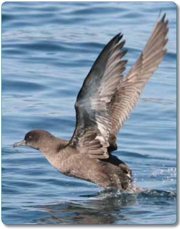
Sooty shearwater (DOC)

Sooty shearwater are a dark coloured bird that grow up to 43 cm with a variable coloured under-wing that ranges from black to light grey. Flight consists of series of rapid wing beats interspersed with long glides. Sooty shearwaters have a circumpolar breeding distribution, preferring islands in the temperate or sub-Antarctic zone. The sooty shearwater feeds on crustaceans (krill and amphipods), fish, squid and salps<sup>73</sup>. They can dive up to 68 m for food, but more commonly take surface food<sup>343</sup>. They will follow fishing boats to take fish scraps thrown overboard.