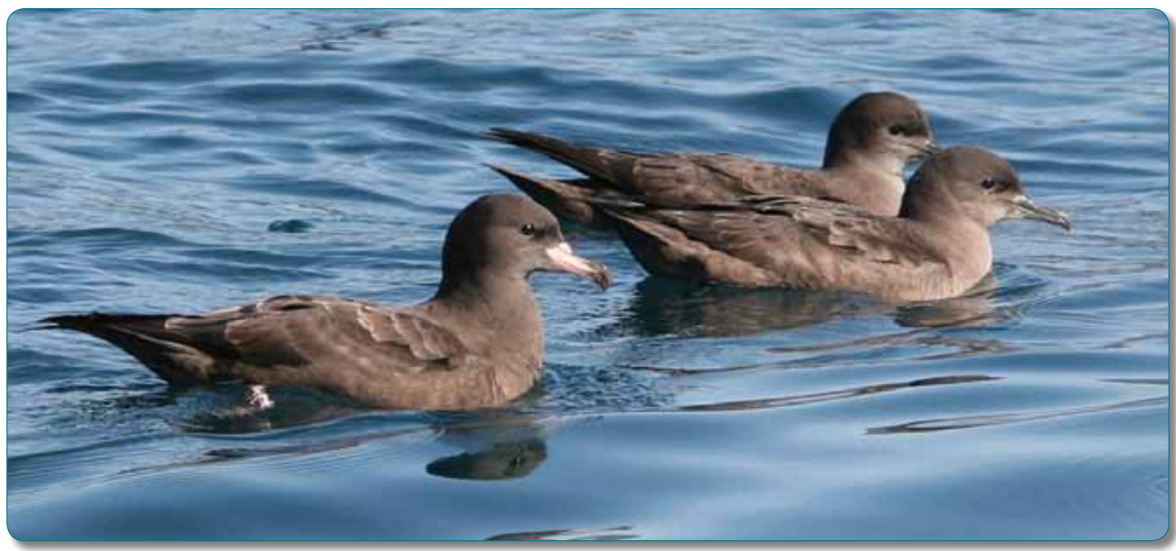
Flesh-footed shearwater, foreground, and two sooty shearwater, behind.

They are regarded as a significant species in Marlborough because of their low numbers surviving at the southern limit of their range. This species has a "declining" status within New Zealand.