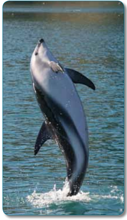
Dusky dolphin

Dusky dolphins are a medium sized dolphin with a short beak. They grow to a length of 1.80m. They are dark grey above and white below, but with blazes of pale grey on their sides.