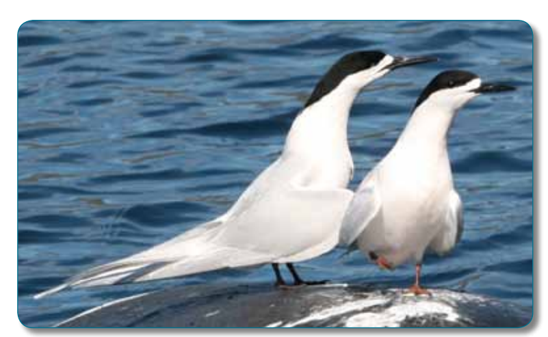
White fronted tern (DOC)