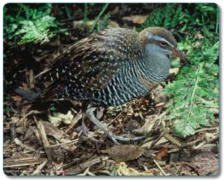
Banded rail (DOC)

They prefer estuarine habitats comprising soft intertidal substrata with scattered rushes merging into dense woody vegetation in the higher tidal reaches. They are usually found in association with a stream or river and sea rushes rather than the jointed wire rush.