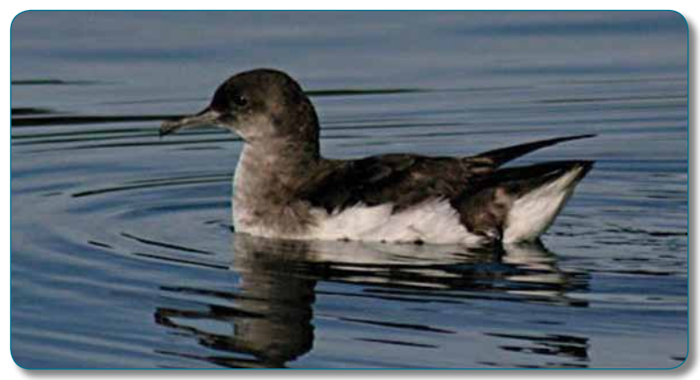
Fluttering shearwater (Kanae Hirabayashi)