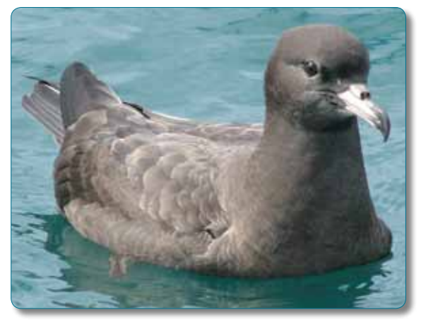
Flesh-footed shearwater (MDC)

Most food is probably obtained at night including squid which may be on the surface<sup>182</sup>. During the day birds will dive deep for prey or scavenge behind fishing vessels.