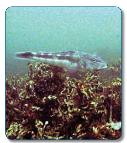
Blue cod swimming above tubeworm mounds, Perano Shoal

This is the single largest area known in the Queen Charlotte Sound where elephant fish regularly lay their egg cases<sup>90</sup>. Shallow elephant fish spawning areas are of international scientific interest<sup>101,115</sup>.