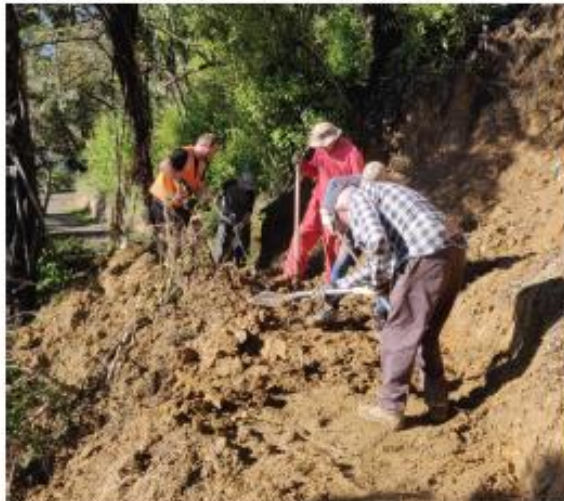
Link Pathway volunteers working on The Grove section of the trail which is now open for use

"The Link Pathway Trust is extremely grateful for the offers of help, and over 70 donations through the Link Pathway Givealittle page, totalling almost $10,000, and we welcome any further contributions to help with the repairs," said Rick.