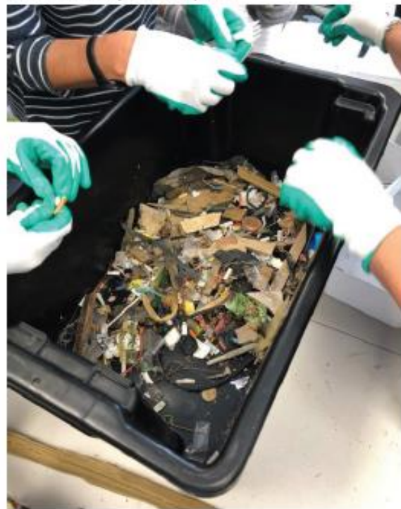
Plastic items make up the majority of the marine litter found in the Sounds

Varying levels and types of microplastics were found in both areas. There is more work to come on this to identify sources of this pollution.