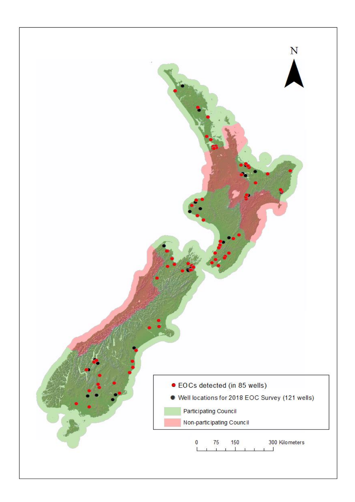
Figure 2: Regions and sampling locations for the 2018 survey of EOCs in groundwater.