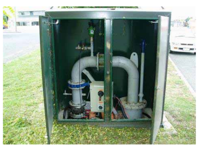
Figure 1.5: Municipal well-field at Grove Road in central Blenheim

Groundwater has been used since the early days of European settlement throughout the district, but