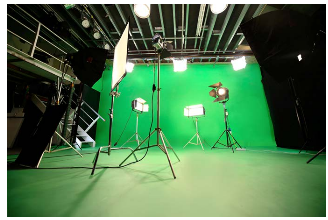
Figure 2 Example of a green screen