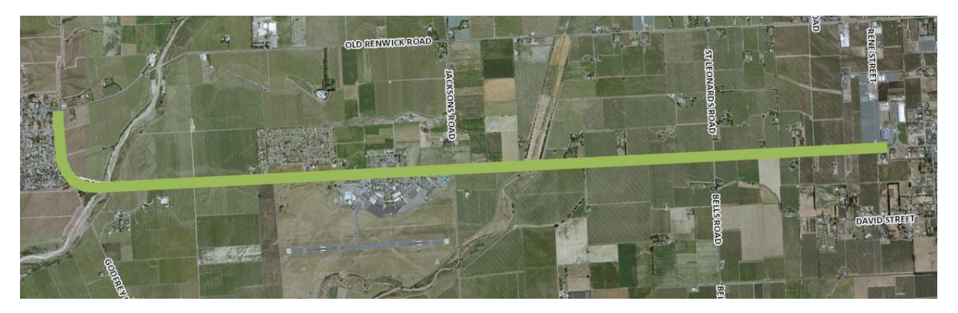
Figure 5 - SH6 Blenheim to Renwick

The State Highway 6 cycle lane is proposed to extend 7.85km from Blenheim to Renwick, see figure 5. This section of State Highway has a speed limit of 100kph in open sections and 80kph in the suburban section of Woodborne.