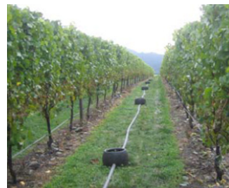
Low rate application system