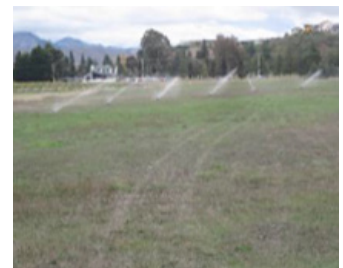
Well monitored application