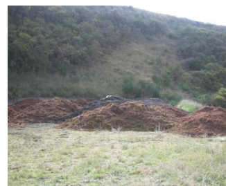
Grape marc stored to land with no leachate collection