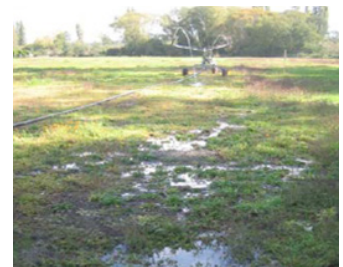
Overwatering causing ponding