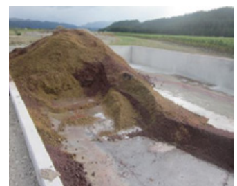
Sealed storage area with leachate collection