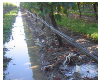
Overwatering causing ponding