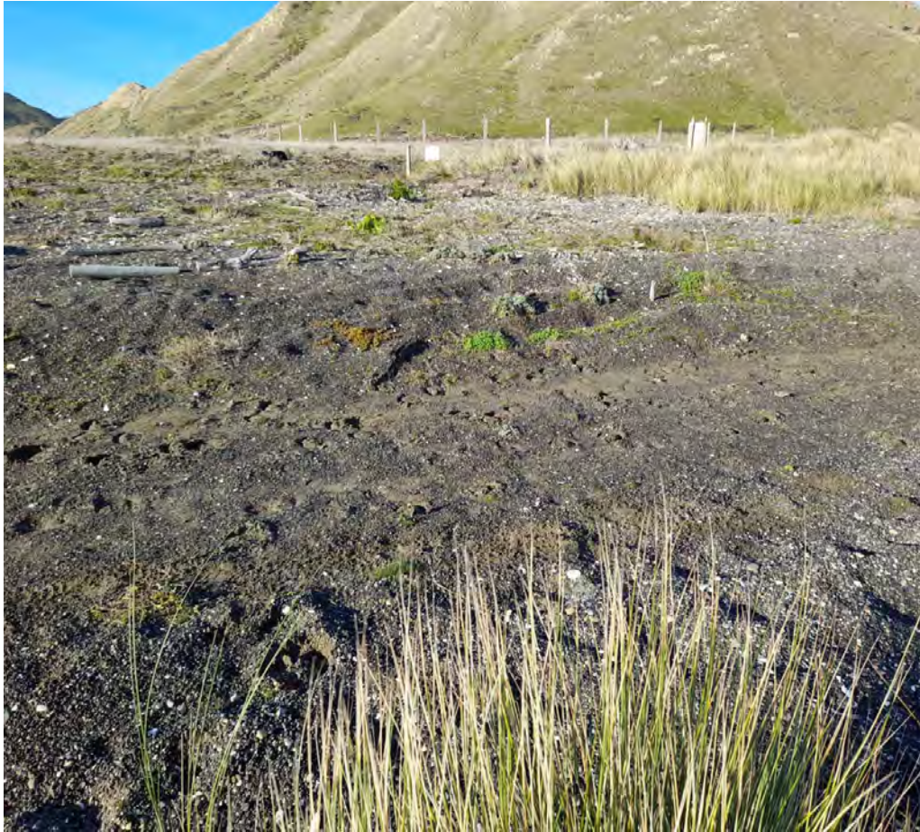
Mussel point looking at Dotterel nesting site