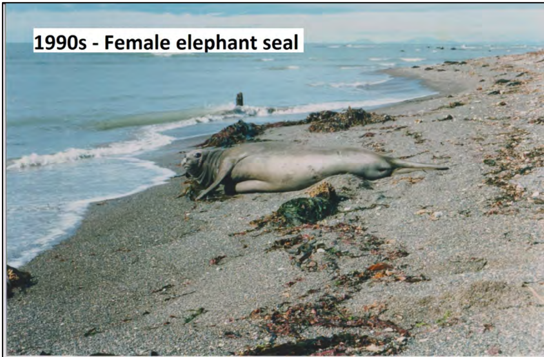
1990s - Female elephant seal