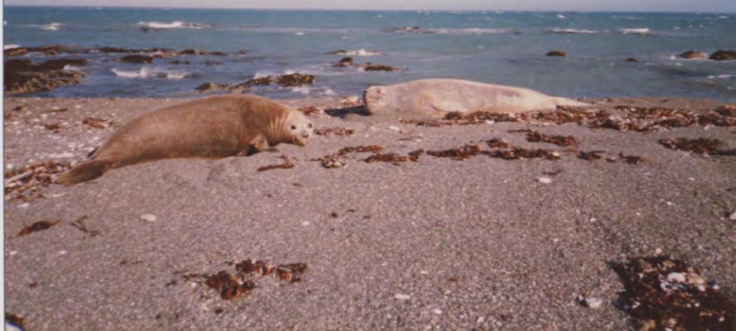
1980s - Mother & daughter elephant seals