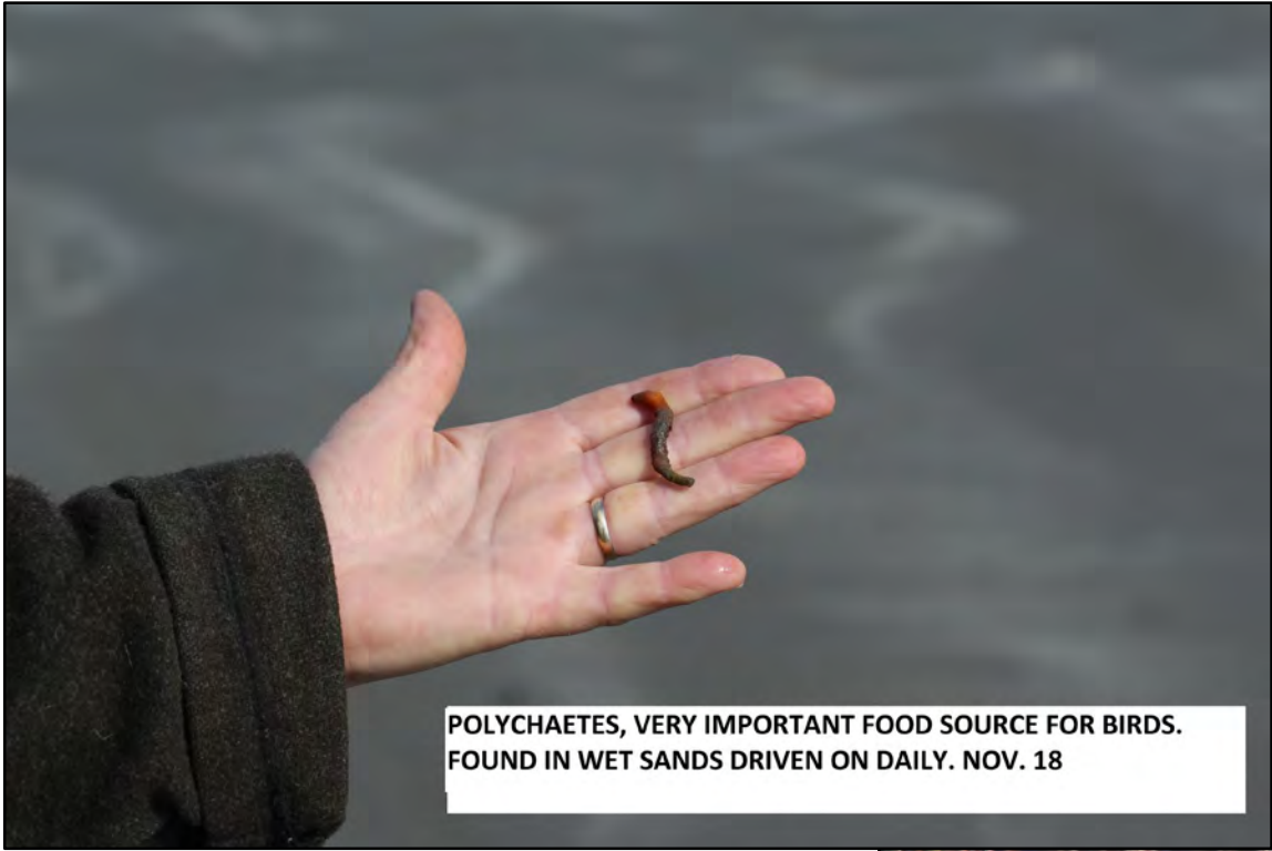
POLYCHAETES, VERY IMPORTANT FOOD SOURCE FOR BIRDS. FOUND IN WET SANDS DRIVEN ON DAILY. NOV. 18