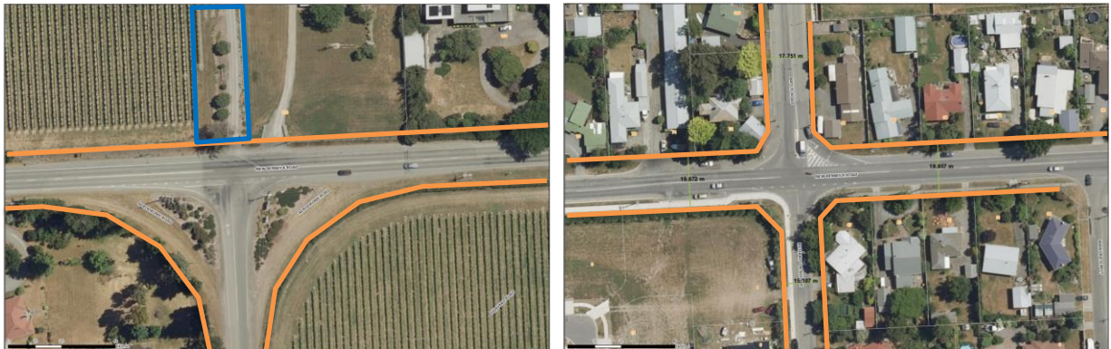
Figure 2 Available Road Reserve

As can be seen, the available road reserve for a roundabout is significantly larger at Aerodrome Road.