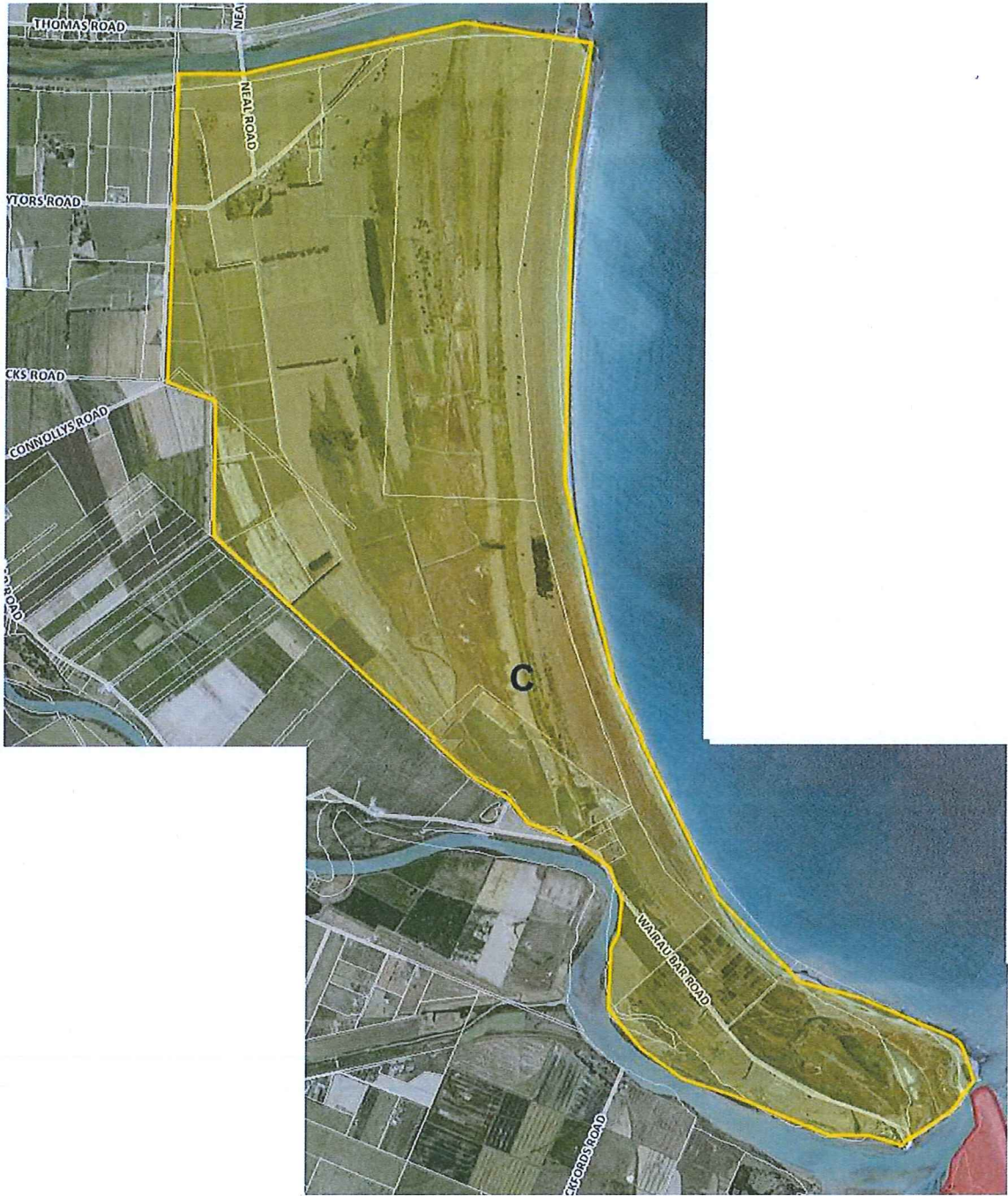
[Map information: Marlborough District Council Smartmaps, with Heritage New Zealand overlay]