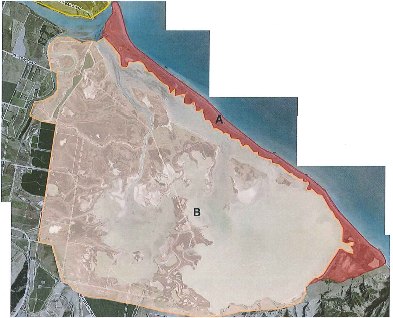
[Map information: Marlborough District Council Smartmaps, with Heritage New Zealand overlay]