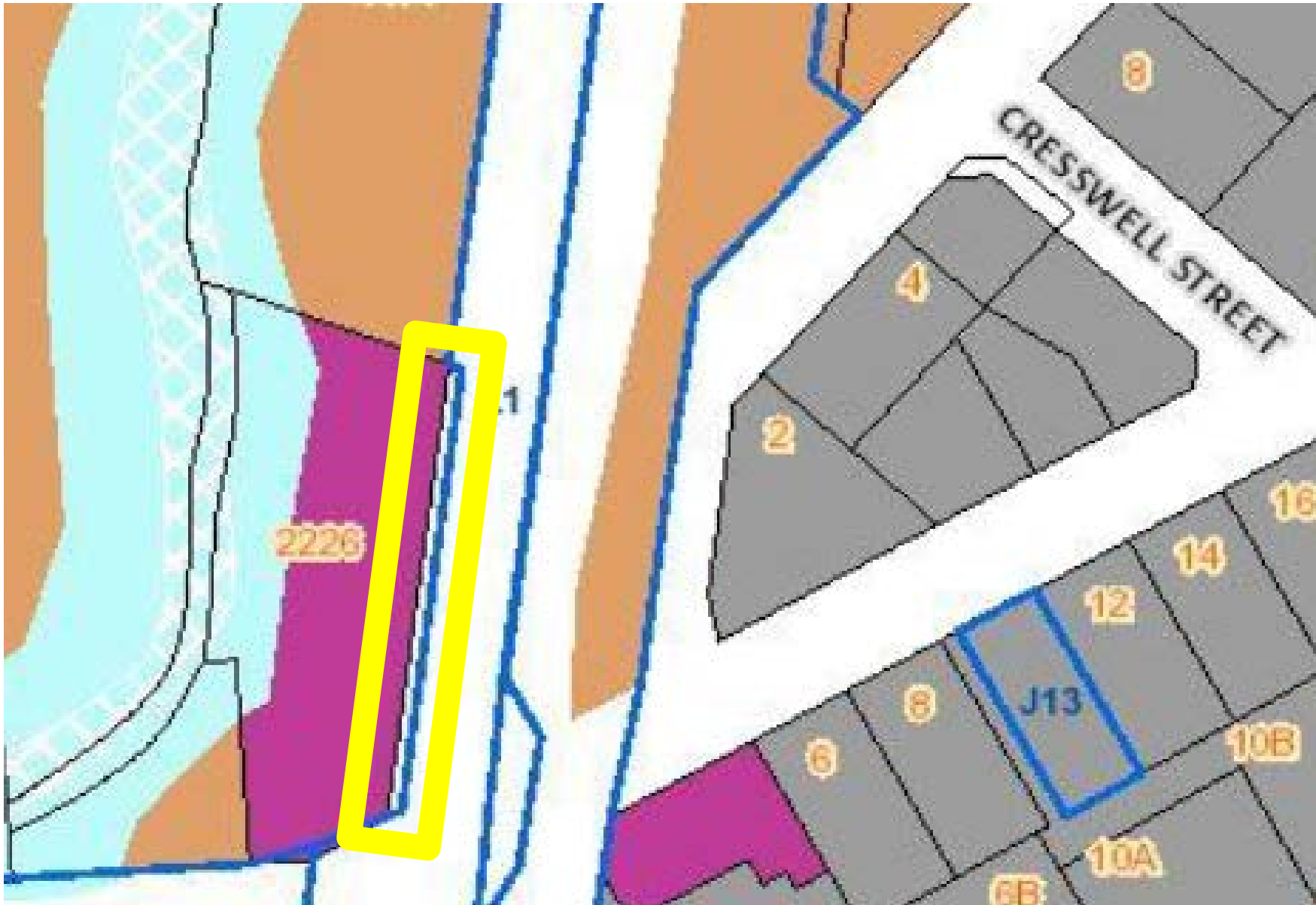
Figure 2: Site 129, with area of alteration in yellow box