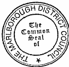
ALISTAIR SOWMAN MAYOR

The Common Seal of the Marlborough District Council was affixed on the 8 February 2008 in the presence of: