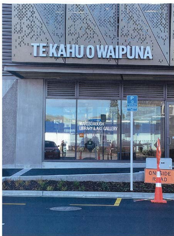
Wynen Street Wayfinder directing visitors around the corner to the main entrances