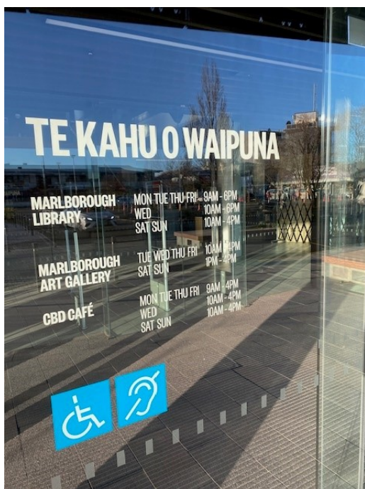
Front Doors (High Street) and West Facing Doors

Supplementary naming and wayfinding signage has been installed on windows in the facility.