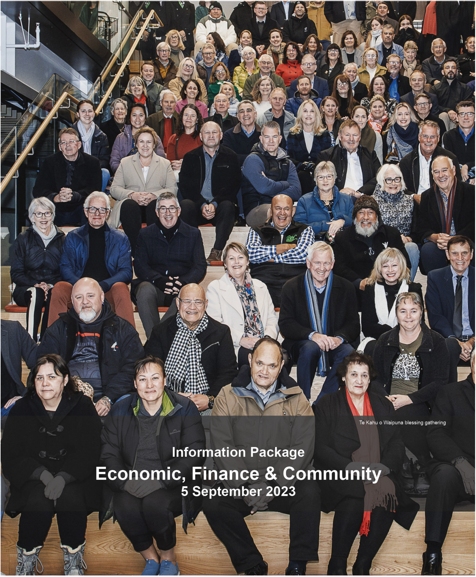
Te Kahu o Waipuna blessing gathering