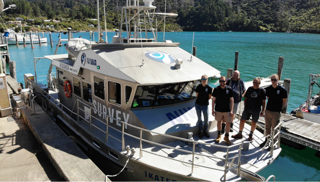
NIWA scientists and crew on the vessel Ikatere

The research vessel Ikatere has been exploring biodiversity on the seafloor in Te Hoiere/Pelorus Sound.