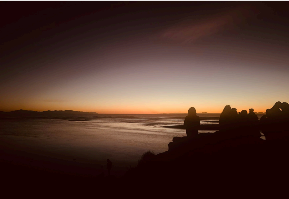
Rangitāne o Wairau’s event to celebrate Te Rā Aro ki a Matariki at the Wairau Bar last year