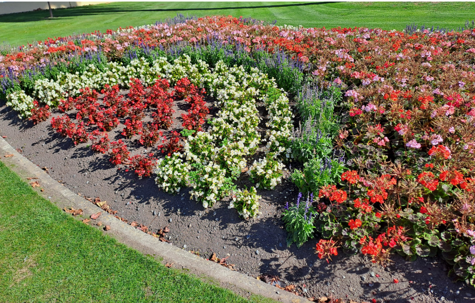
These annuals will be up for grabs in Seymour Square on Monday

Our gardeners will be on site to help. Please bring a fork and containers.