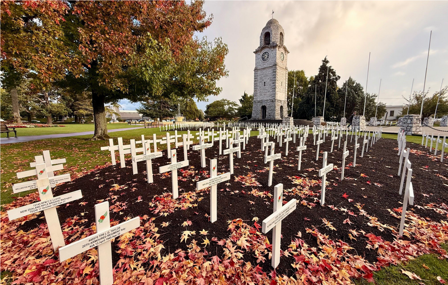
Some of the dozens of white crosses in Seymour Square

Every April, Council gardeners prepare the flower beds in Seymour Square for the Anzac Day commemorations.