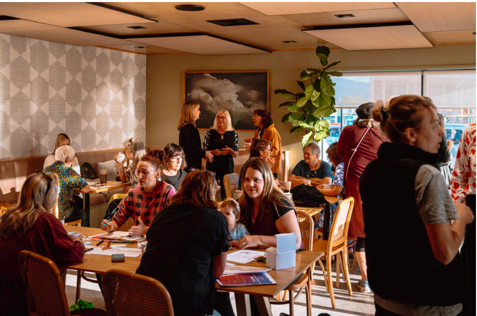
The first Café Create was sold out - Marlborough's creative community are advised to register early for the next one

Each gathering features light refreshments, a guest speaker, Q and A session and networking.