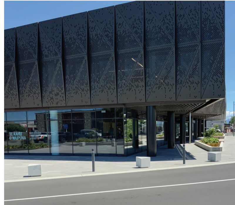
Spot the difference - the corner of High Street and Symons Street in Blenheim's CBD in 2009 (left) and today (right)