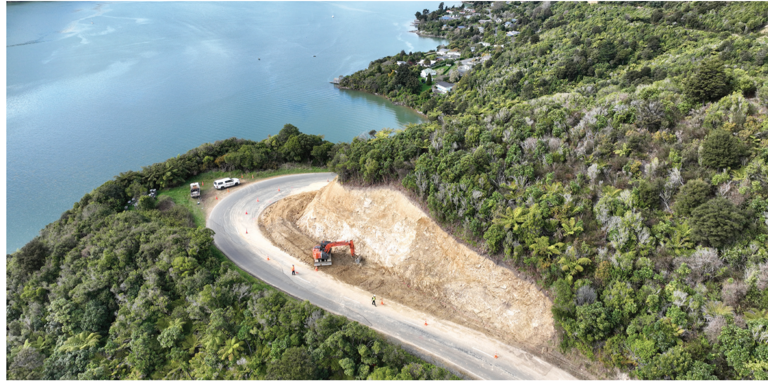
Repairs to Queen Charlotte Drive, Cullen Point, near Havelock, October 2023.