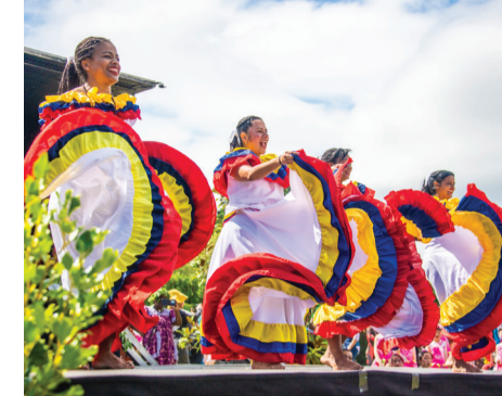
The Marlborough Multicultural Festival is one of many popular events to look forward to this autumn in Marlborough

Grab your guide from Council's Blenheim and Picton Service Centres, i-SITES, ASB Theatre and local cafés and restaurants. You can also visit the official online regional events calendar at www.follow-me.co.nz