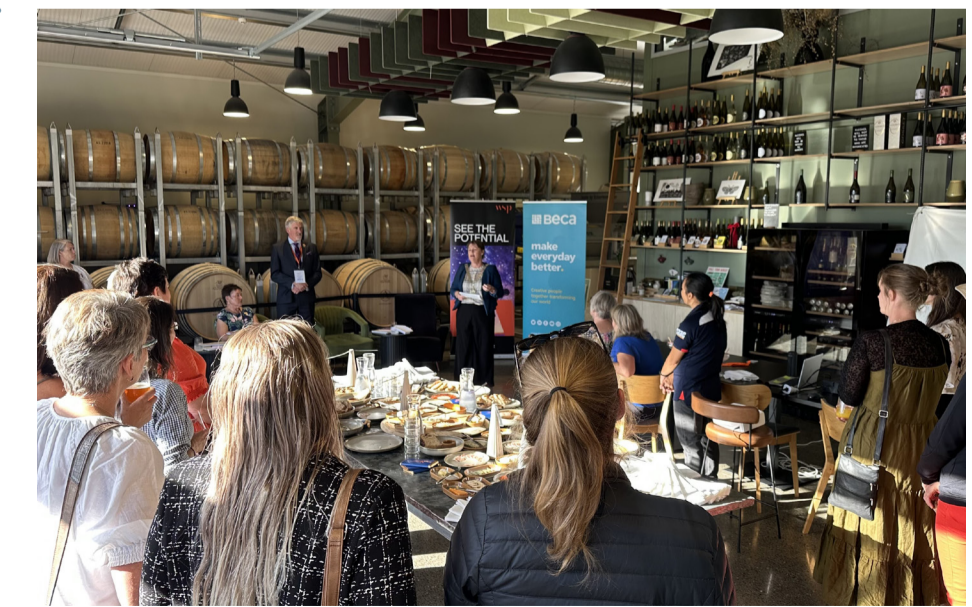
A new chapter for women in construction will help them continue to break through glass ceilings and concrete floors, Mayor Taylor told launch attendees

For more information, go to: www.nawic.org.nz