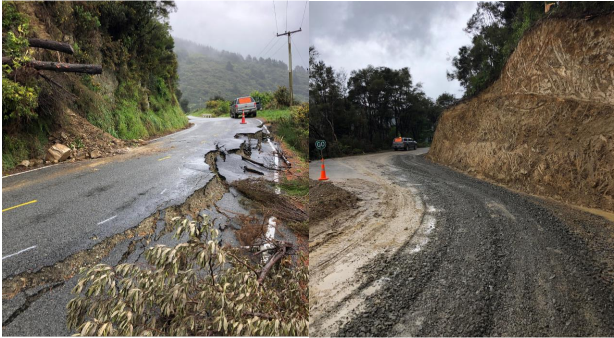
(Above) Mistletoe slip before and after

On Kenepuru Road, two significant areas have been cleared, Mistletoe slip and the under slip at Route Position (RP) 12.8, which is 400 metres before Mahau Road.