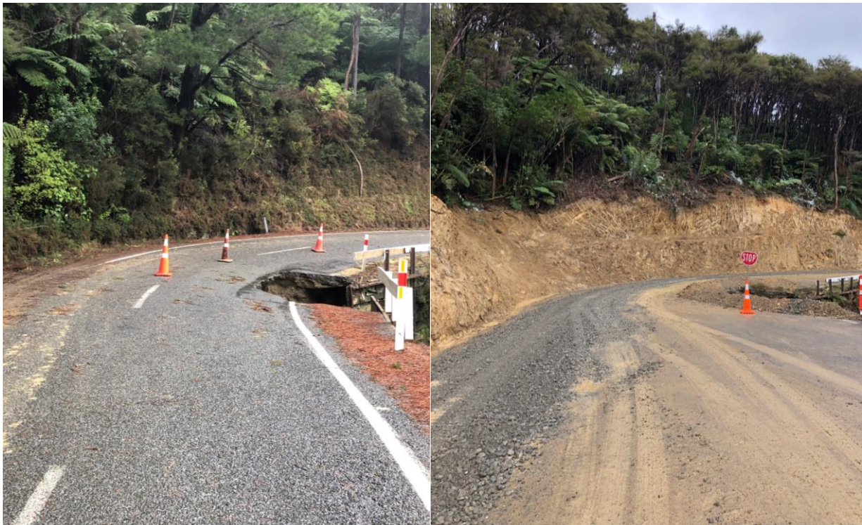
(Above) 400m before Mahau Road, at RP 12.8, earthworks have been undertaken to widen the road and restore the road width.