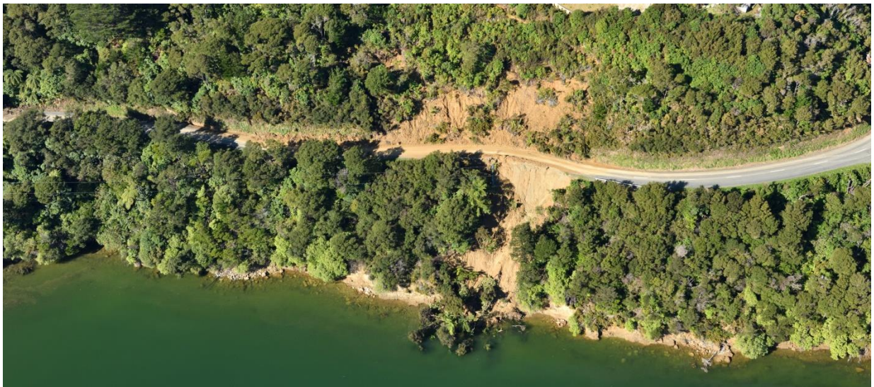
Kenepuru Road, near Portage

Recovery to agree levels of services for all users