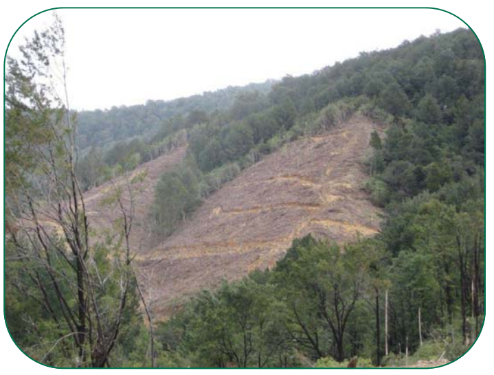
A recently harvested forest surrounded by native vegetation and seed sources.

Commercial logging may also introduce the risk of new weed species being introduced to a site on the tracks of heavy machinery. It is quite common to see species such as pampas and buddleia appear after heavy machinery has been used.