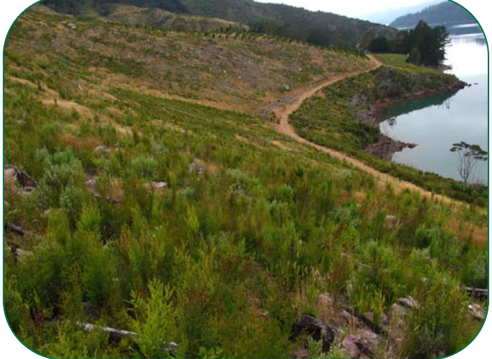
South-facing slopes on Skiddaw four years after being sprayed and burnt showing kānuka and tauhinu regeneration well under way.

The weed Spanish heath is making a comeback, covering whole faces and crowding out both pasture and natives.