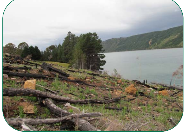
Poets Corner" (above) after spraying and burning. Scenecio minimus and kānuka are regenerating among the logs. Newly planted natives have also been established (below).

Wilding pines on 1ha around the barge loading site are hand-pulled.