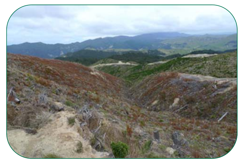
Harvested hill country at Maungataniwha forest, Hawke's Bay.

The Forest Lifeforce Restoration Trust is restoring more than 4000 ha of radiata pine in northern Hawke's Bay to regenerating native forest. Three-quarters has been logged by Rayonier NZ, which owns the cutting rights.