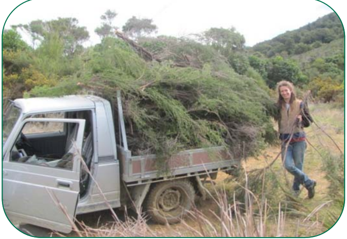
Emily Osborne with a load of mānuka branches for spreading at Skiddaw in Pelorus Sound.

Gorse and broom are colonising species and can be a first stage to native succession where conditions are favourable. They can also outcompete pine seedlings and therefore are a preferable weed species if the long-term goal is native succession. There are a number of examples in the Sounds where gorse has been succeeded by native species within 20-30 years with no active intervention.