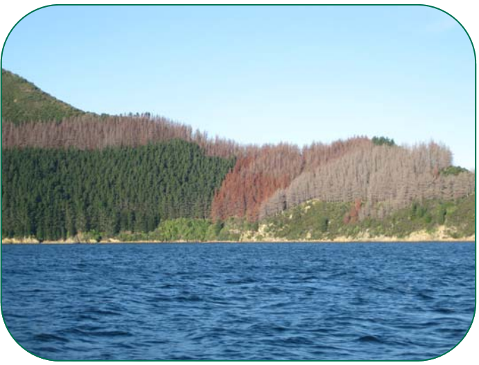
Example of small standing forest on Maud Island in central Pelorus Sound where ground based control is being carried out using herbicide injection.

Guidelines on choosing a method can be found at <u>www.soundsrestoration.org.nz</u>, under "Wilding Pine-Advice For Landowners". The cost of control can vary widely depending on tree size and location. Marlborough Sounds Restoration Trust experience is that it should be possible to manually ground control a closed-canopy forest of radiata pine for $1,500 to $3,000/ha. While this is an