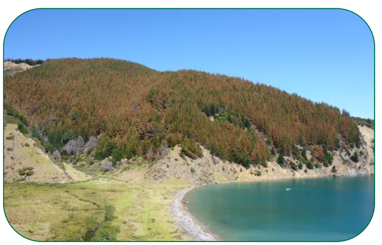
A block of 20 year old pines on D'Urville Island six months after being sprayed from the air using metsulfuron-methyl.

There is ongoing research to perfect this method for other pine species in New Zealand with new options potentially becoming available over time.