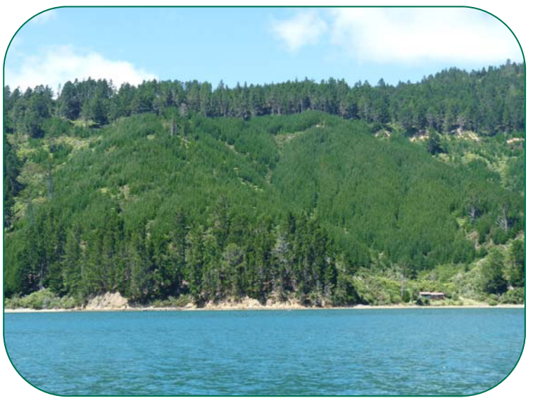
A NW facing Queen Charlotte Sound property showing dense pine regeneration on the mid-slopes following harvest where no intervention has taken place.

Native regeneration can be vigorous in north Marlborough, especially on shady and moist south-facing slopes. However, regrowth tends to be slower and less dense on northern faces and weeds including unwanted pine seedlings, broom, old man's beard etc can quickly become dominant once pines are removed. Experience shows that where there is no management intervention after harvesting, pine seedlings will generally regenerate vigorously and dominate a site. While some believe that in the long term (100 years plus), pines will eventually be replaced by natives through successional processes, others suspect that pines will instead continually re-colonise light gaps as they become available and therefore perpetuate themselves in many cases.