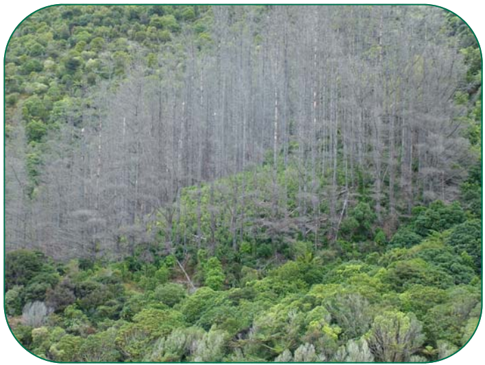
Mature pines killed by herbicide injection with vigorous regeneration coming through underneath.

If however the process is slowed through a managed transition back to native vegetation only, the situation is more challenging. Will you still see adequate regeneration of forest if you remove pine regrowth from the site? The answer is still a qualified yes, but two factors need to be taken into account.