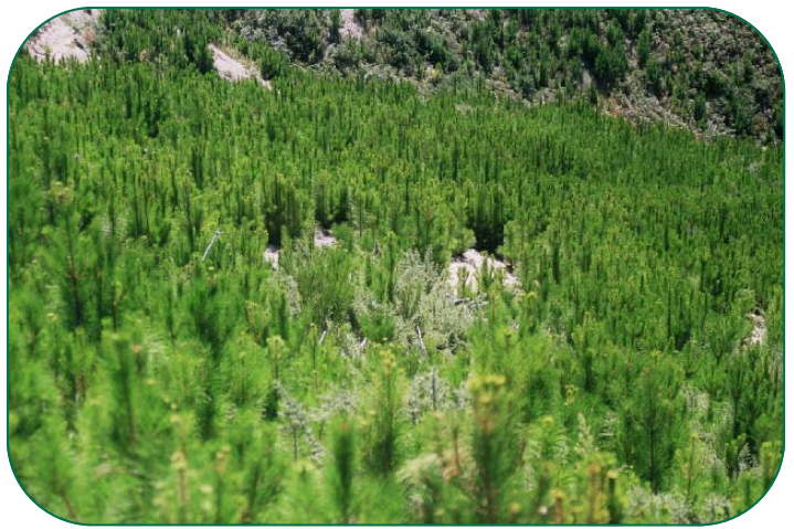
A carpet of regenerating pine seedlings suitable for control by aerial spraying.

young pine regrowth post-harvest and prior to replanting. It is the only viable method of control for large areas. Again, metsulfuron-methyl is the chemical to use with an organosilicone penetrant to enhance absorption. Rates can be less than for mature standing pine plantations, about 200grams per hectare at a cost of approximately $150-$250/ ha. The chemical is most effective while the tree is actively growing (October-January). To minimise the inevitable by-kill of native species, it is important that metsulfuron-methyl only is used, rather than another herbicide or herbicide mix, such as metsulfuron and glyphosate. Although most native species will initially be knocked back, some waxyleaved native species such as putaputawētā,