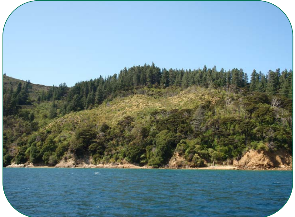
Two photos of the Blackwood Bay property showing the 2ha area where trees were harvested in 2002 on the mid-slope, and trees on adjoining property behind (top photo), which were later killed by herbicide injection, removing a future pine seed source (bottom photo)

"The virtual absence of goats has made things much easier," says Andrew.