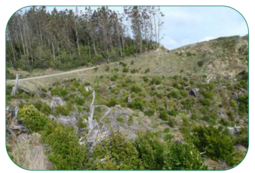
Regenerating native vegetation in a moister gully at Maungataniwha.

The approach is to do nothing for at least three years after harvesting, leaving a mosaic of different intensities of wilding pine. The densest wilding areas are then boom-sprayed by helicopter with metsulfuron herbicide plus penetrant. In gullies and other areas where natives predominate, experienced ground crews with chainsaws manually fell pines and chemicals are not used.