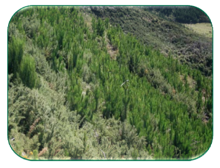
Pine seedlings carpeting the ground two years after harvest in Port Underwood.

Ground-based manual control using either herbicide injection or basal bark methods is the most targeted method, in that only pines die with no incidental by-kill of native understorey. Surrounding natives will therefore provide shade and competition to any pine regrowth. While manual control is initially expensive, it may save money in the long run by reducing follow-up costs.