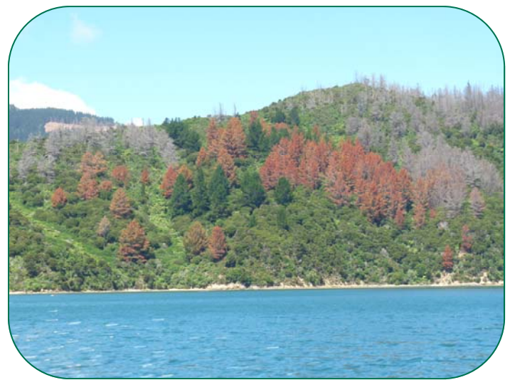
Standing pine trees that have been treated using the herbicide injection method. The grey trees were treated two years ago, the orange trees six months ago.

These methods are generally best suited to contractors, who will have the required gear and qualifications for this work. There is a cost in employing contractors, however landowners are often pleasantly surprised at how much can be achieved in a day. Once again, work should not be carried out under dead standing trees in strong winds.