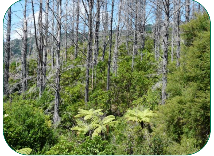
Native vegetation regeneration under dead standing pine trees killed through herbicide injection in Tory Channel.