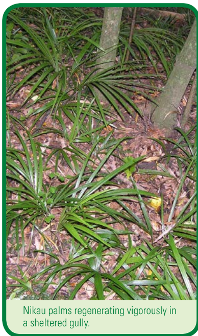
Nikau palms regenerating vigorously in a sheltered gully.

Once you have clarified the purpose of your planting and studied conditions at your chosen site, the following lists can be used to select suitable plant species according to ecological district, site conditions and personal preferences (such as growth form, height at maturity, attractiveness to birds and rarity).