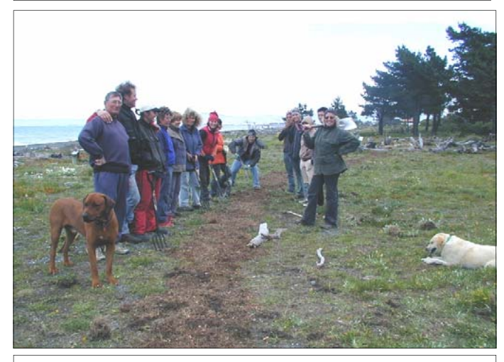
Creating a pathway