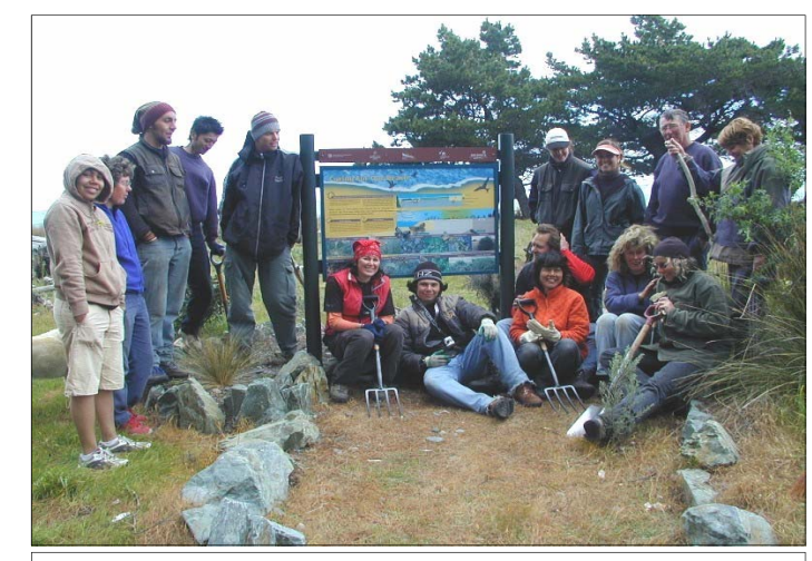
Days end —Vineyard staff relax in front of Landcare sign.