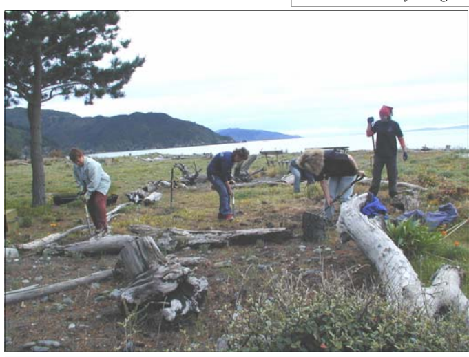
Enlarging enclosure area.

pathway around the driftwood enclosures was