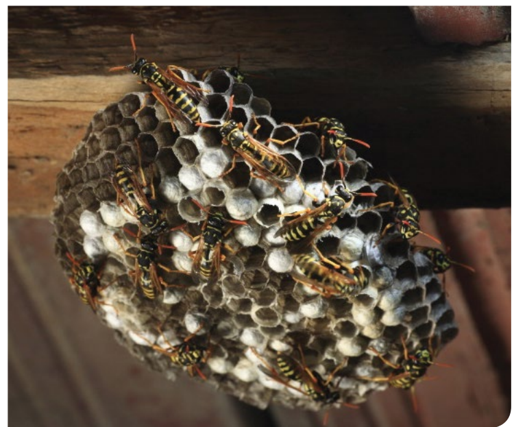
European paper wasp nest in roof space (Image: Hungarian Natural History Museums publications).

Contact MPI's free 24-hour pest and disease hotline 0800 80 99 66