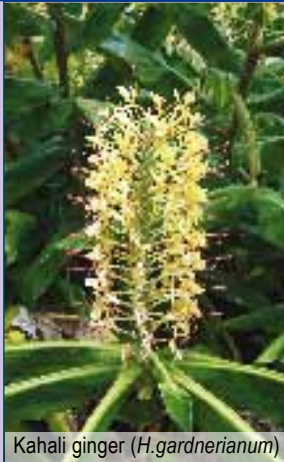
Kahali ginger ( H. gardnerianum )

Herbaceous perennials with large, branching, tuberous roots that form mats up to 1 metre thick. H. gardnerianum spreads by seeds and root fragments, while H. flavescens spreads only by root fragments. Forms dense colonies in natural areas, smothering native plants and preventing native seedlings establishing.