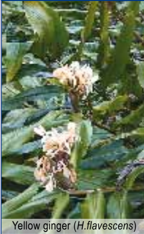
Yellow ginger ( H. flavescens )