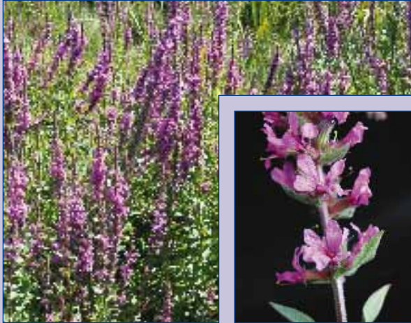
W.Mead / N.Procter (inset)

Tall, hardy perennial growing to 2 metres with mid-green, lance-shaped leaves, and spikes of pinky-purple flowers followed by black seed capsules. Grows in a wide range of conditions including lake margins, ditches, wetlands and paddocks, forming dense invasive colonies and crowding out native plants.