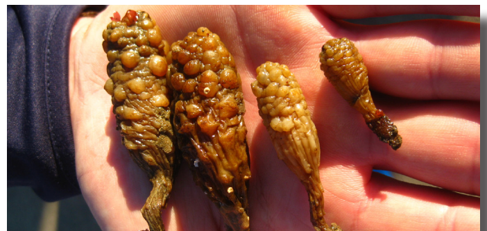
Some of the Styela clava removed from Picton Marina.

If you think you've found a marine pest call the MPI Hotline 0800 80 99 66. They are well equipped to investigate and work out what action needs to be taken.