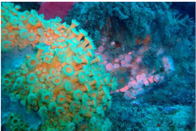
White Rocks Current Community

https://www.marlborough.govt.nz/environment/coastal/coastal-ecosystems/significant-marine-sites