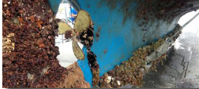
The fouled vessel hull where Mediterranean Fanworm was discovered in Waikawa Bay in February 2014.

NZ King Salmon and Council sought public comment on the guidelines and after some minor changes the next step is for NZ King Salmon to progressively put them into practice at the company's five older farms at their eight sites. The three farms approved in 2013 already have tougher consent conditions.