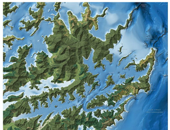
NIWA Blue Water Chart Series showing bathymetry over 43,000 hectares of Queen Charlotte Sound/Tōtaranui and Tory Channel / Kura Te Au.

The seafloor mapping campaign took 280 days on the water, taking soundings on 224 days from two vessels. This survey has gathered more than 30 terabytes of digital information, with an estimated 5,549,300,000 depth-data points collected by the multibeam systems across a coverage of 433 km 2 .