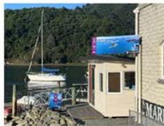
Tuia Hub/Office is next door to Edwin Fox, sponsored by Port Marlborough

Follow us on social @totaranui250 Website: www.totaranui250.co.nz