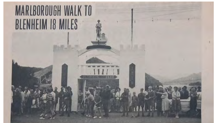
The event that we think has done more to popularise our Province than any other single item. In the grey light of early morning walkers mill around waiting for the official starting signal.