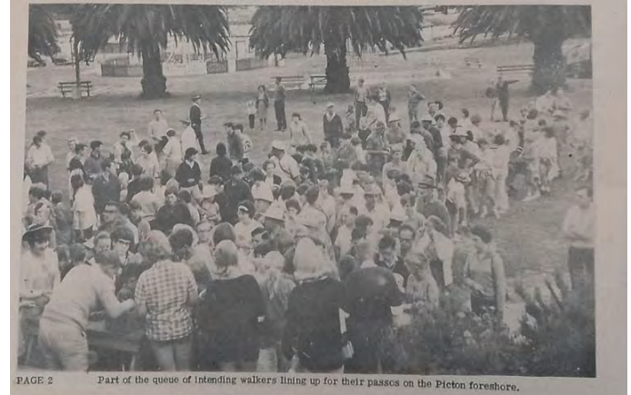
PAGE 2 Part of the queue of intending walkers lining up for their passes on the Picton foreshore.