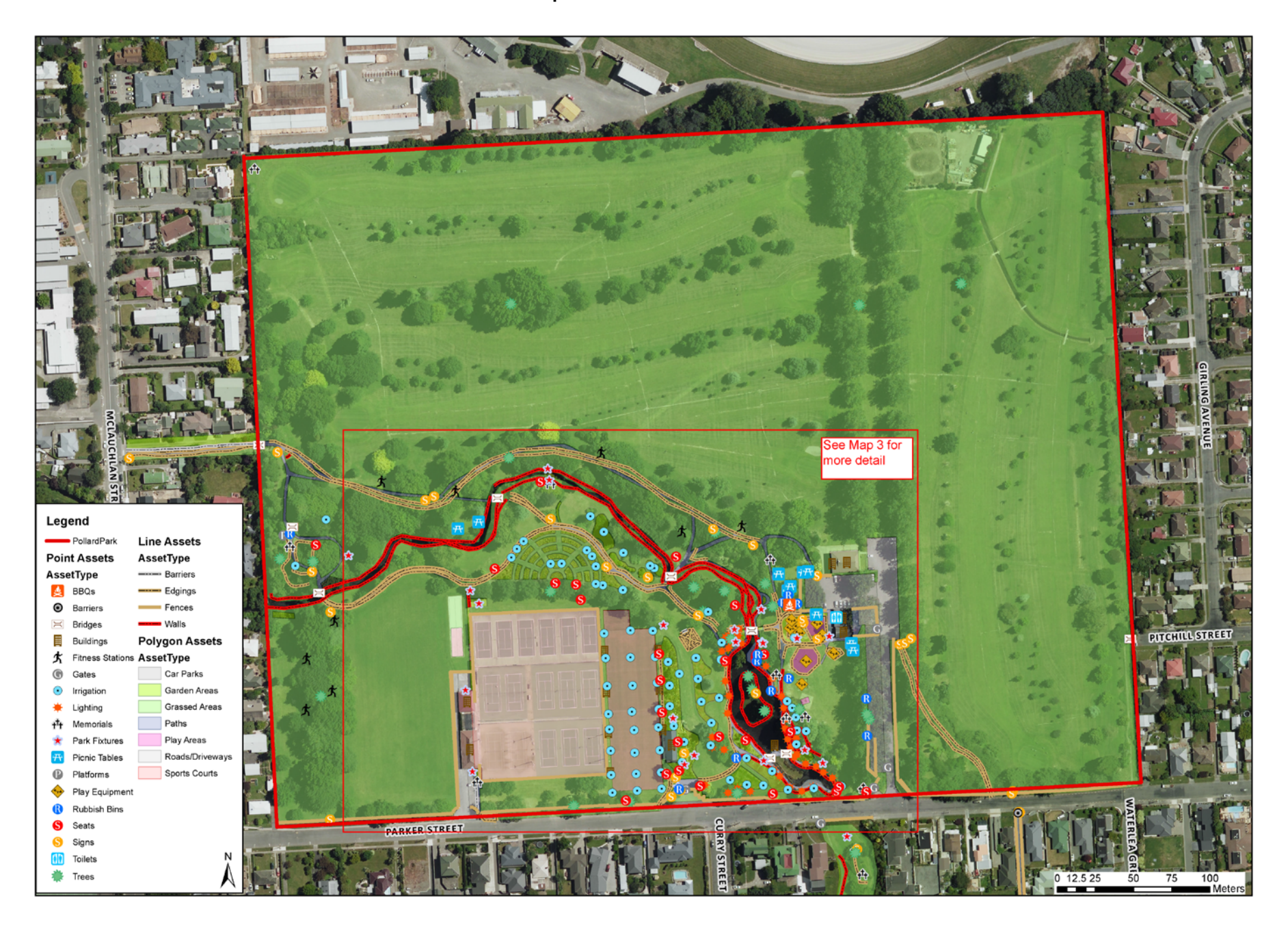
Map 3: Pollard Park Assets