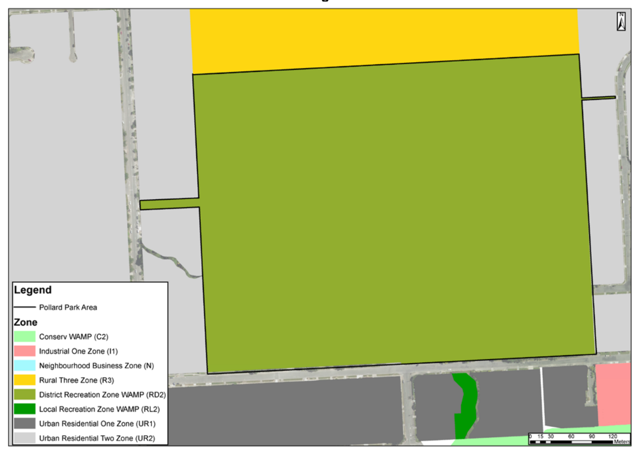
Map 2: Pollard Park Zoning

Under the Wairau/Awatere Resource Management Plan Pollard Park is zoned District Recreation Zone.