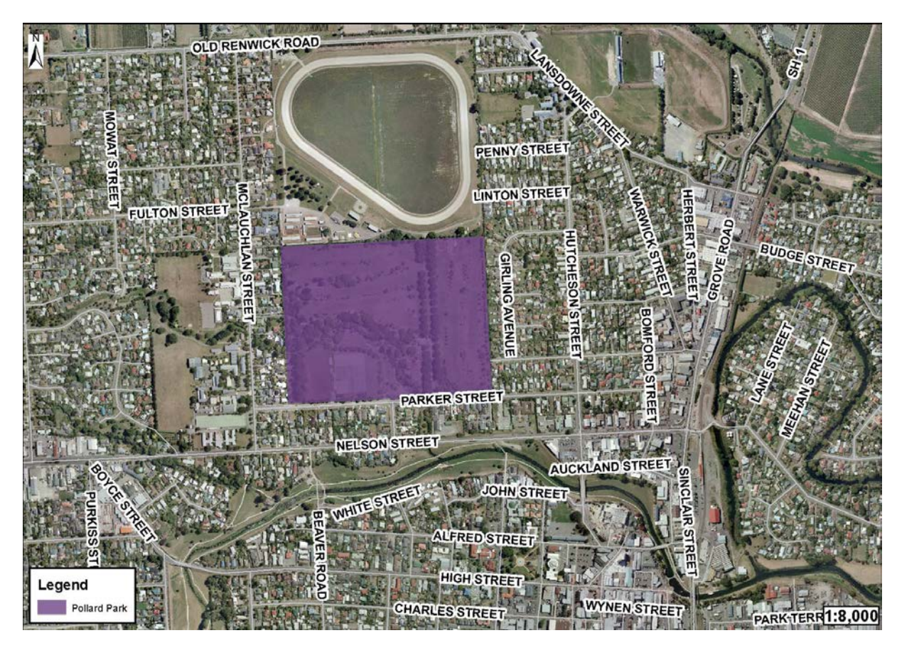
Map 1: Pollard Park Location