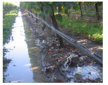
Overwatering causing ponding