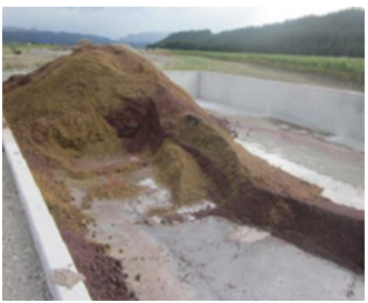
Sealed storage area with leachate collection