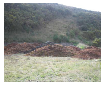
Grape marc stored to land with no leachate collection