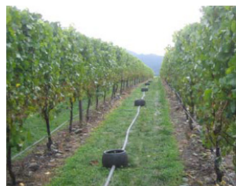
Low rate application system