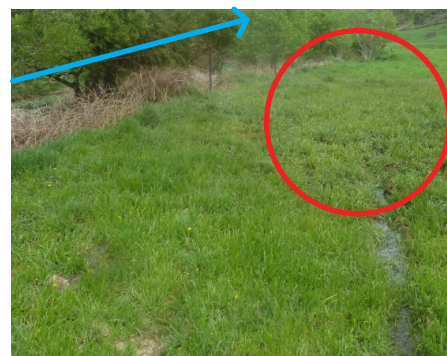
Effluent spread within 20m of waterway.