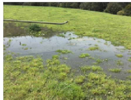
Ponding from effluent spread to land.