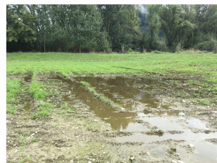
Ponding from effluent spread to land.