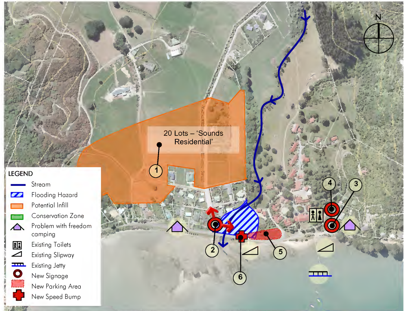
ABOVE FIG. 7-7: Summary of proposed initiatives in Anakiwa