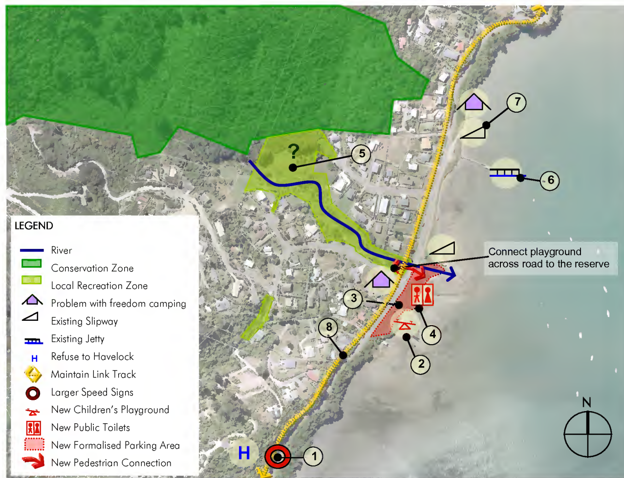
ABOVE FIG. 7-8: Summary of proposed initiatives in Tirimoana