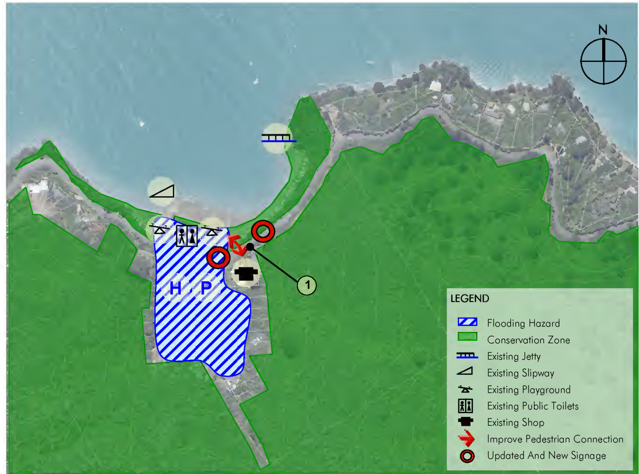
ABOVE FIG. 5-2: summary of proposed initiatives