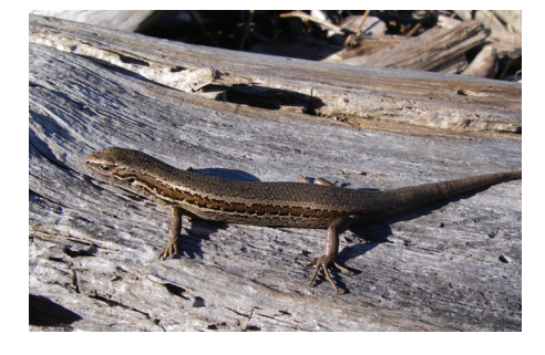
The Waiharakeke grass skink, found only in Marlborough, is at-risk and declining.

Throughout New Zealand, some threatened flora are key structural species for ecosystems, so impacts on these have significant consequences for entire systems. For example, specialist dune species Pimelea prostrata and raoulia mat daisies provide a home for the nationally endangered "Cape Campbell" Pimelea looper moth . On the East Coast, six indigenous plants have been identified as threatened or at-risk.