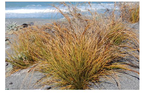
Pīngao (an at-risk species) is important for reptiles to thrive in the area.

Naturally uncommon ecosystems - such as active sand dunes and braided riverbeds - covered less than 0.5% of the country's land mass prior to human arrival. The Cape Campbell dunes have largely escaped the impacts of human activity due to their remote location. As a result, they still hold populations of indigenous species such as the katipō, an at-risk spider that's declining nationwide.