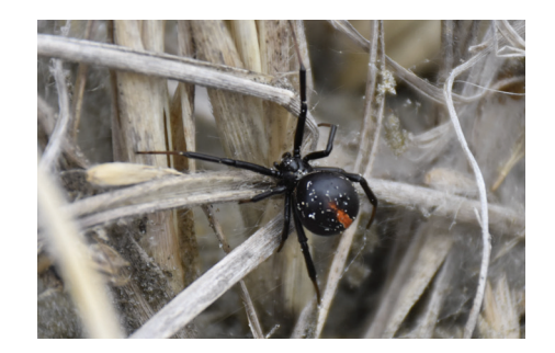
The East Coast has one of the largest katipō spider populations in the country.

Naturally uncommon ecosystems - such as active sand dunes and braided riverbeds - covered less than 0.5% of the country's land mass prior to human arrival. The Cape Campbell dunes have largely escaped the impacts of human activity due to their remote location. As a result, they still hold populations of indigenous species such as the katipō, an at-risk spider that's declining nationwide.