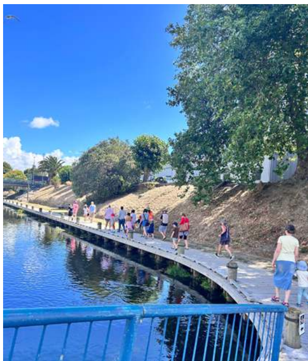
Riverside reading session