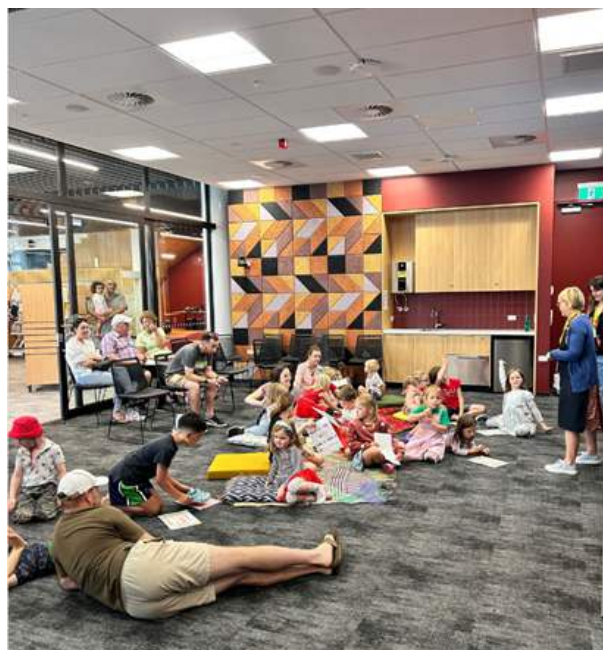
Holiday afternoon activities