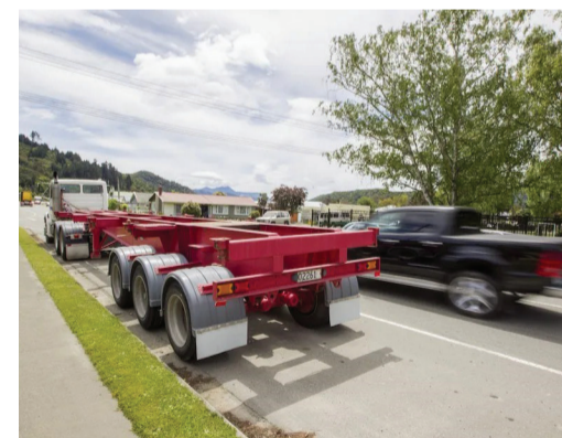
Trucks parking on Picton streets could become a thing of the past if a truck park in Waitohi Domain goes ahead

The cost of terminating the lease with Port Marlborough is $209,500.