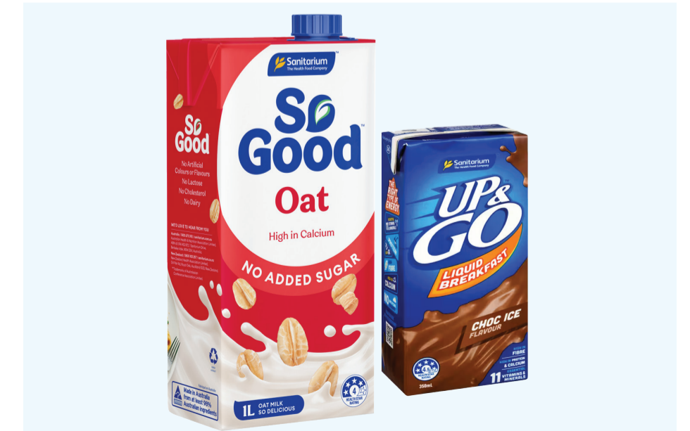
Council's Hazardous Waste Centre is now an approved collection point for containers like these