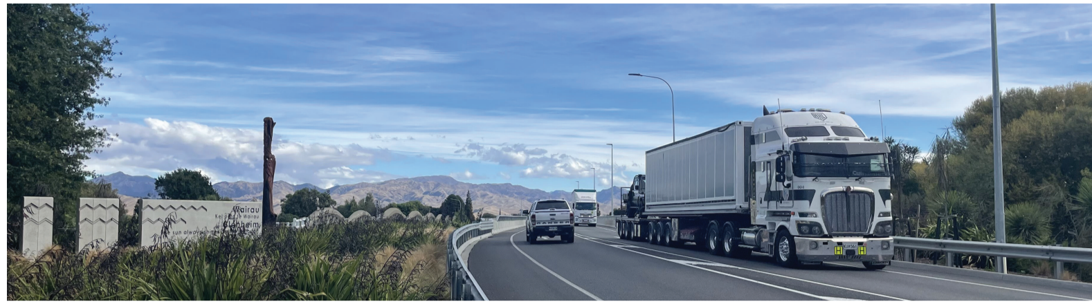
Improving freight efficiency on Marlborough's roads is one key focus in the Marlborough Regional Land Transport Plan