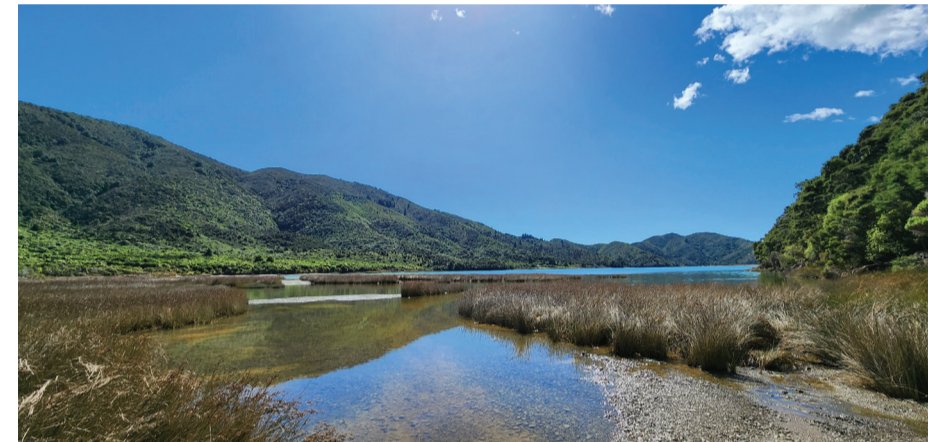
Native bush surrounding Whangarae Estuary helps keep it natural and in good health.

"Estuary and intertidal monitoring includes broad and fine scale mapping and seagrass and sediment monitoring which gives Council robust information about the changing state of each estuary," she said. "This report shows everything here is tracking quite beautifully."