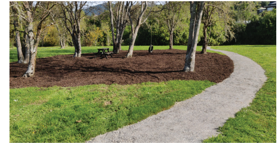
The newly installed path and barked area under the kowhai grove complete with picnic tables

The area under the kowhai trees has been barked and the addition of picnic tables built by Havelock Menz Shed provides a shady spot for a rest or picnic.