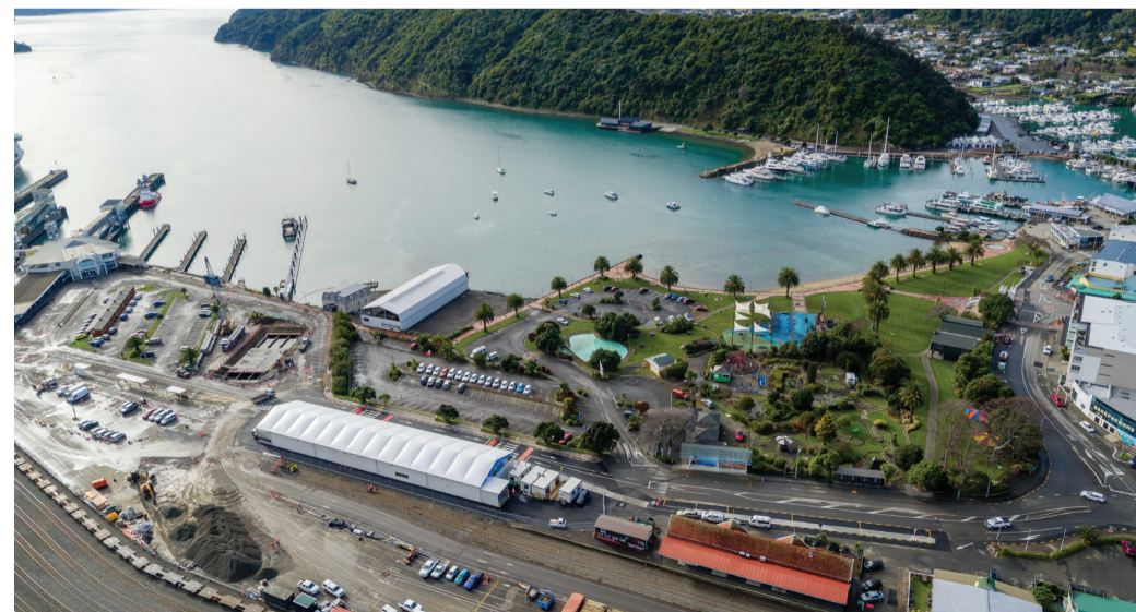
Council continues to advocate for investment in the Cook Strait ferry connection between Picton and Wellington

The appointment of the Ministerial Advisory Group follows the Government's decision last year not to provide further funding for the Inter-Island Resilient Connection (iReX) project.