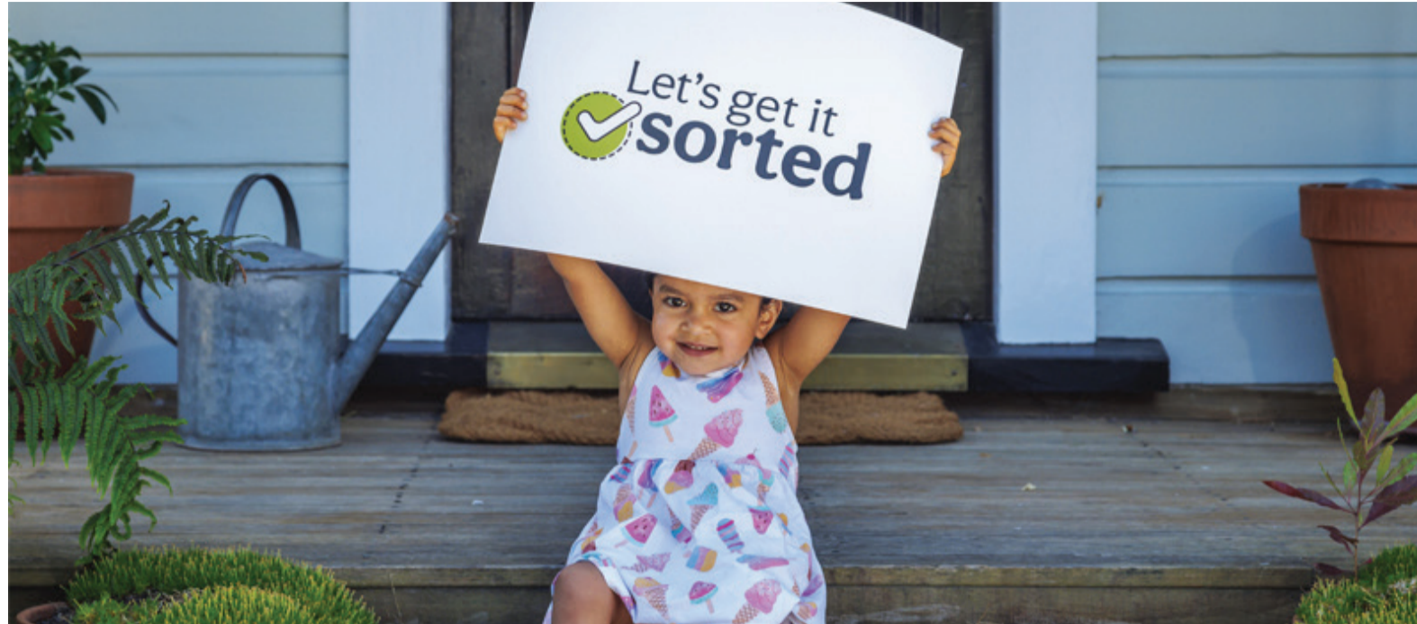
Let's get it sorted for future generations - an expanded kerbside collection is coming with wheelie bins rolling out from 1 July