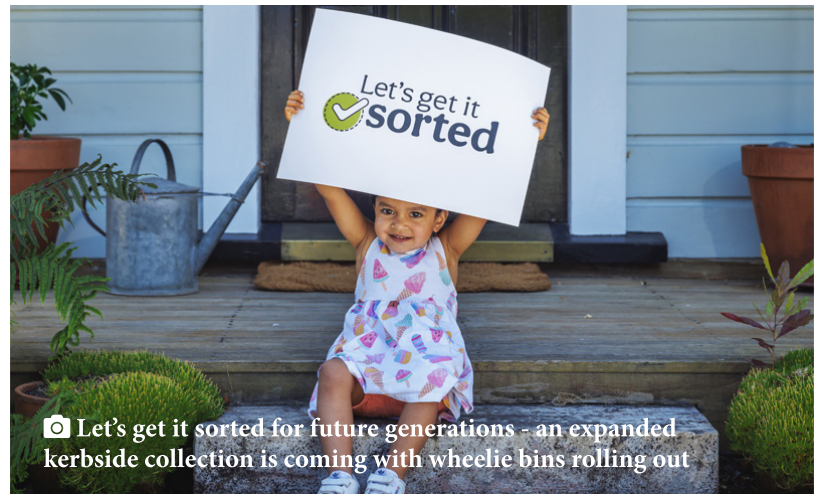
Let's get it sorted for future generations - an expanded kerbside collection is coming with wheelie bins rolling out

The new and expanded kerbside collection service covers Blenheim, Grovetown, Havelock, Picton, Rarangi, Rai Valley, Renwick, Seddon, Spring Creek and Tua Marina with household waste collected one week and recycling the next. Two wheelie bins will be delivered to each household from March (ready for the kerbside service starting 1 July), one for household waste and one for recycling, except glass, which will go into the maroon crate currently used for recycling. Residents in new areas covered by the service will also be delivered a maroon crate.